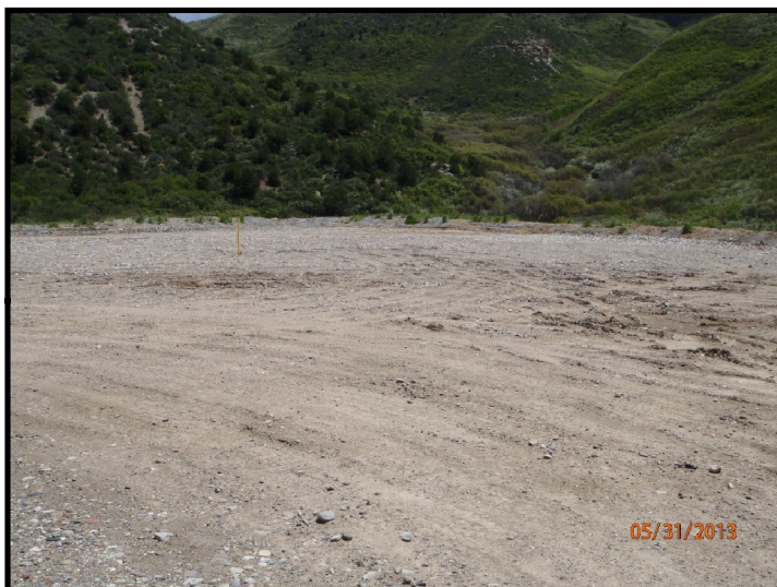
Castle Springs Federal Q Pad Looking East