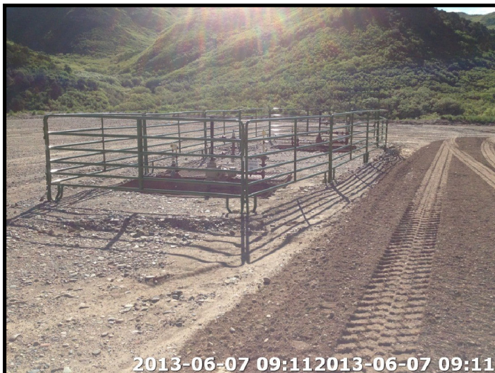
Castle Springs Federal Q Pad Looking South