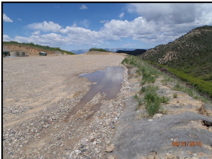
Castle Springs Federal Q Pad Looking North