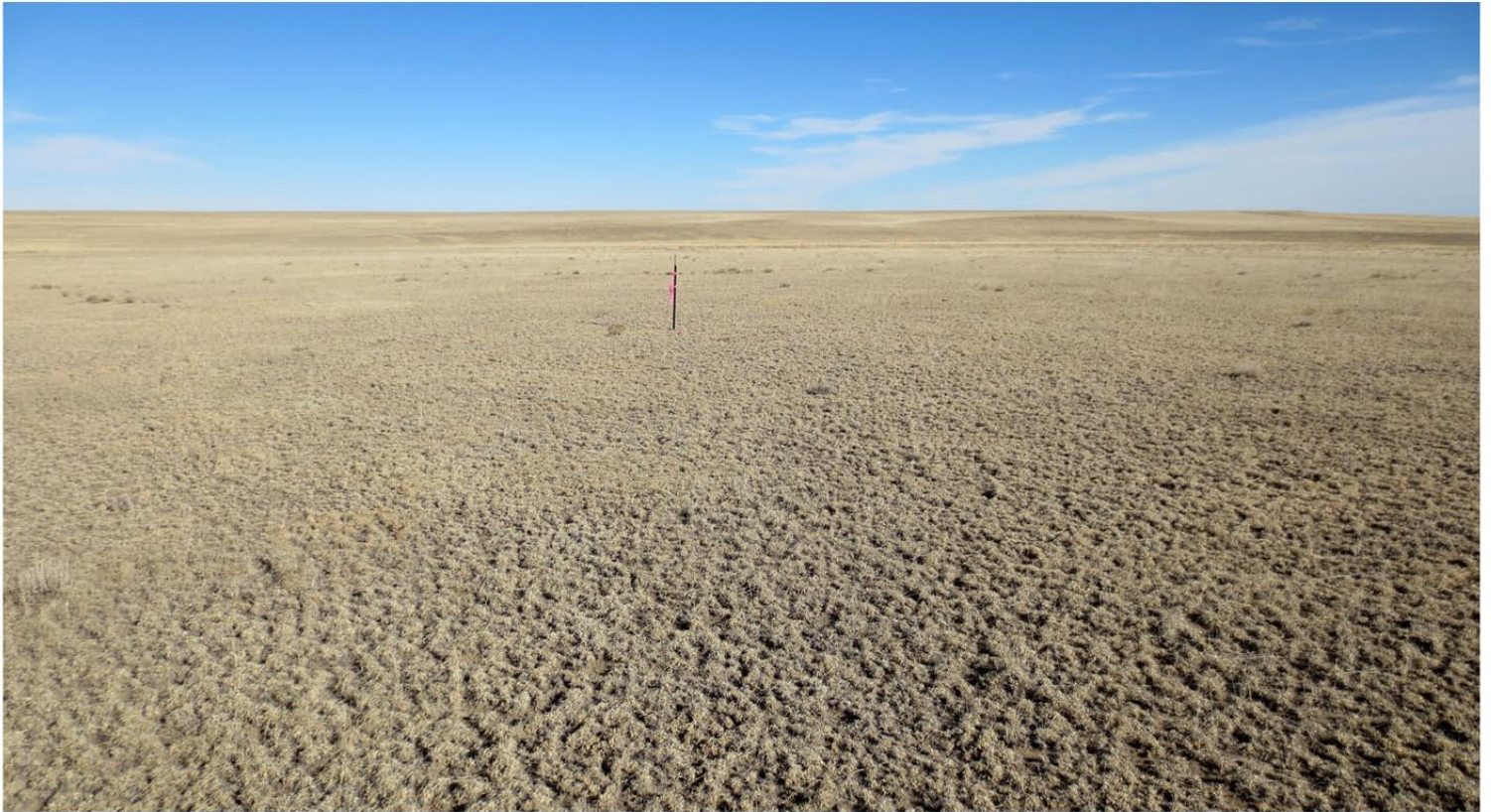
WELL PAD VIEW (LOOKING EAST)