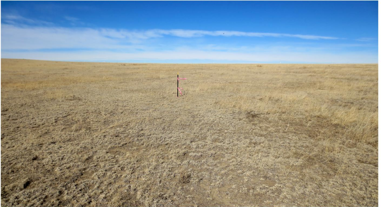
WELL PAD VIEW (LOOKING NORTH)