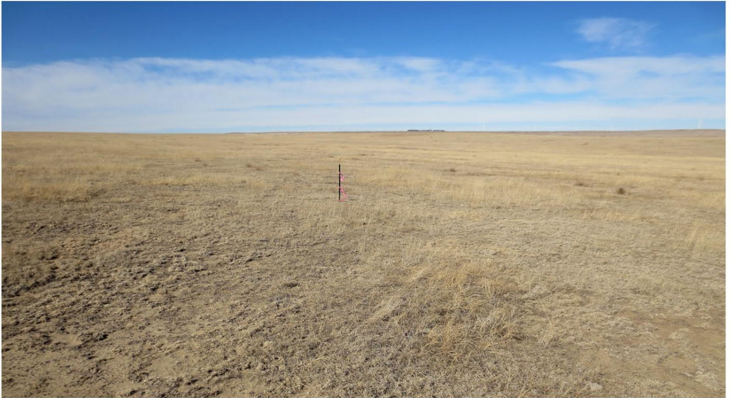
WELL PAD VIEW (LOOKING NORTH)