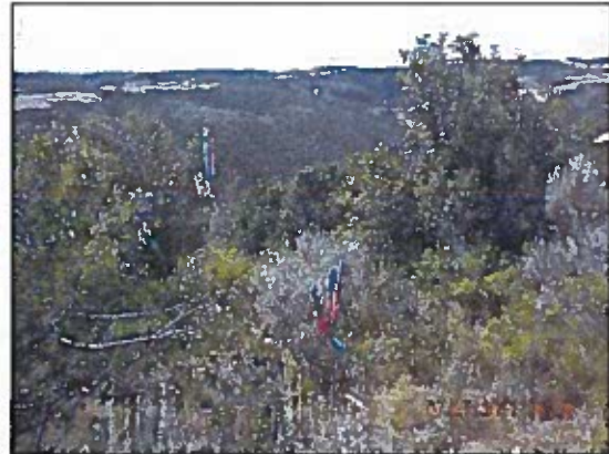
REFERENCE AREA LOOKING WEST 7/27/2011

REFERENCE AREA CENTER STAKE (DO NOT DISTURB) LATITUDE (NAD 83) NORTH 39.521544 DEG. LONGITUDE (NAD 83) WEST 108.213413 DEG.