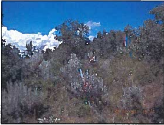
REFERENCE AREA LOOKING NORTH 7/27/2011