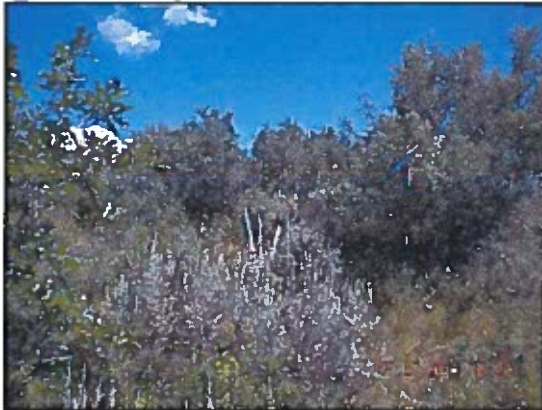
REFERENCE AREA LOOKING EAST 7/27/2011