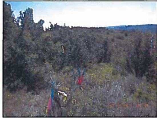
REFERENCE AREA LOOKING SOUTH 7/27/2011