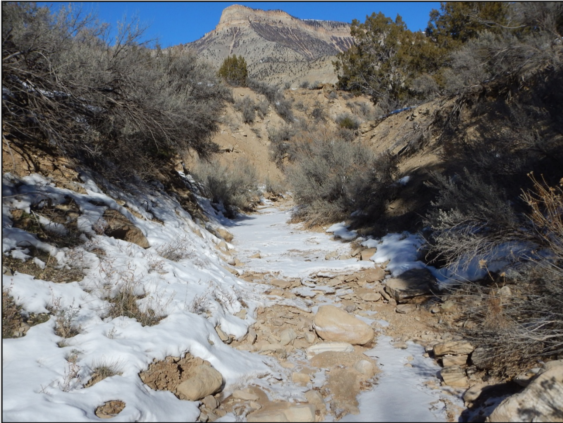
Photo 1. Unnamed stream upgradient of the East Parachute Tank Farm (January 2014).