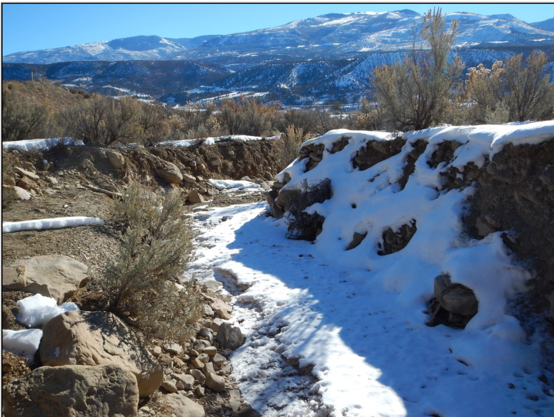
Photo 2. Unnamed stream downgradient of the East Parachute Tank Farm (January 2014).