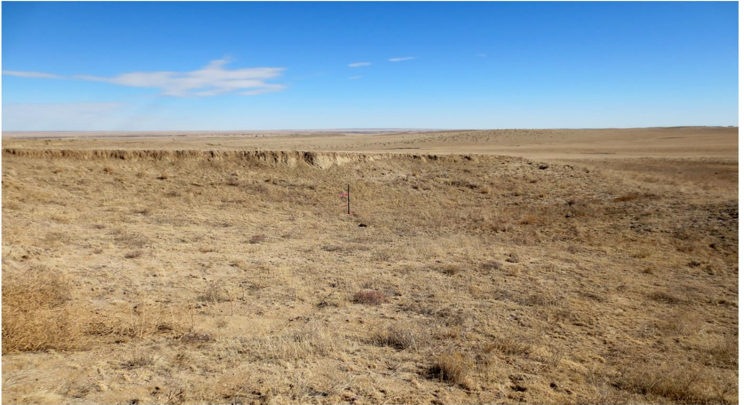
WELL PAD VIEW (LOOKING EAST)