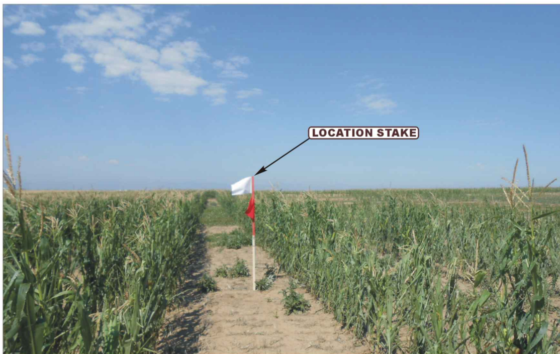
PHOTO: VIEW OF LOCATION STAKE