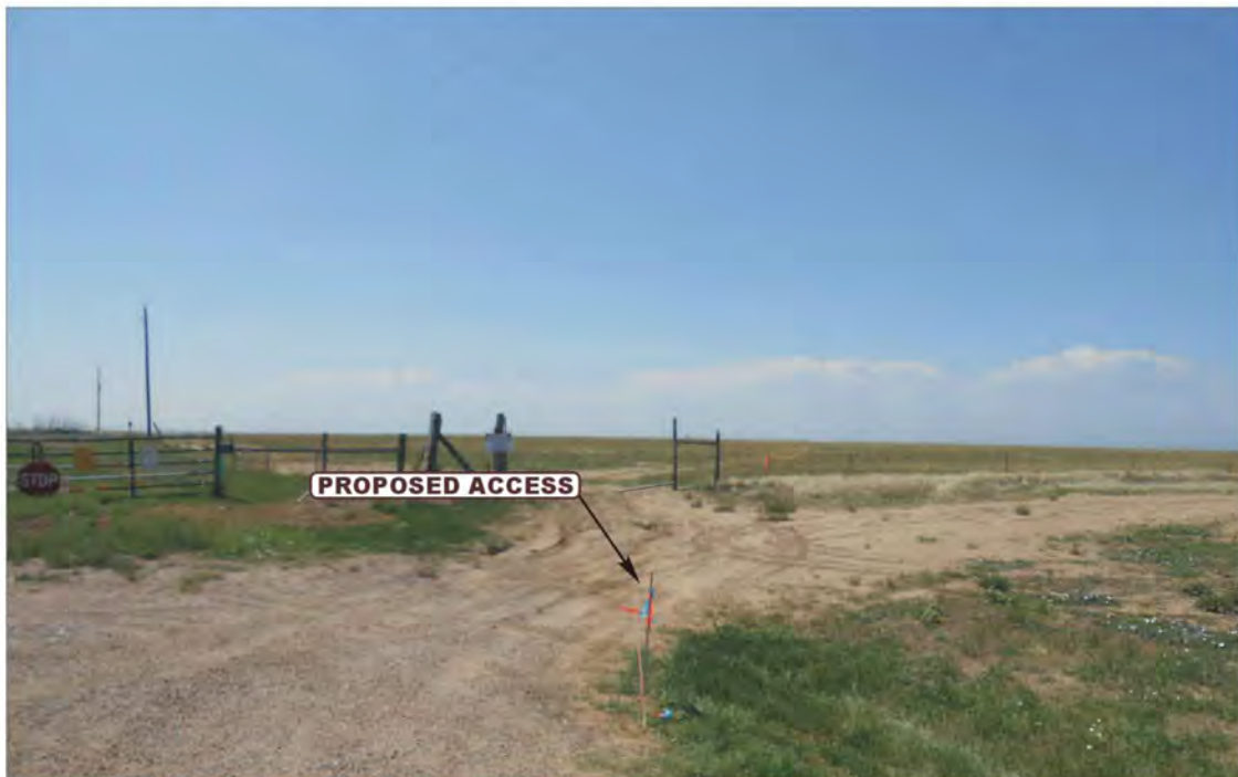
PHOTO: VIEW FROM BEGINNING OF PROPOSED ACCESS