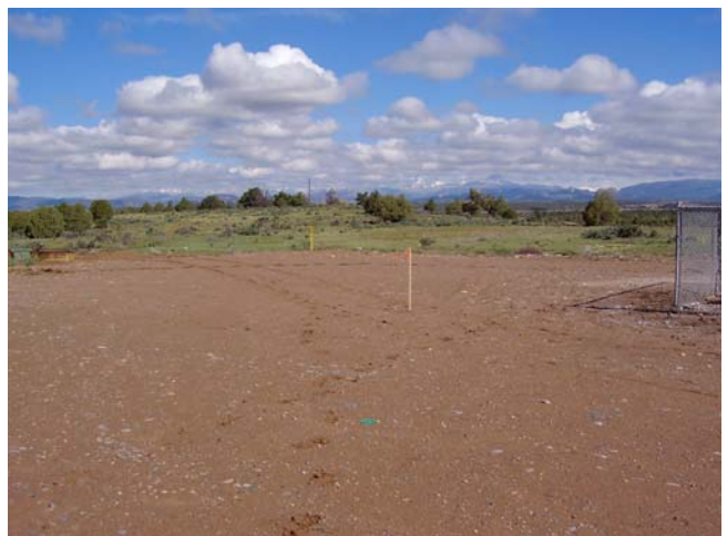
Access at Road