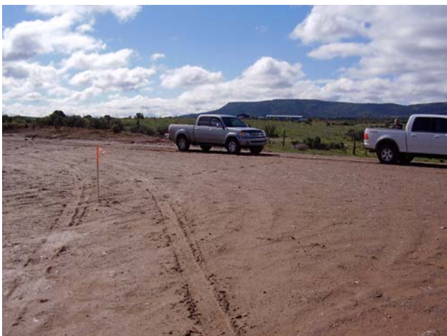
Access at Well Location