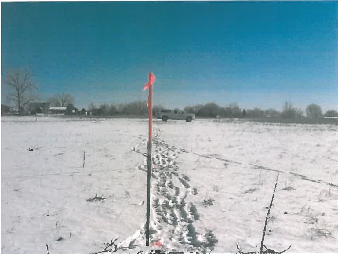
Figure 2: EBERLE PAD LOOKING EAST TOWARDS ACCESS ROAD (NE1/4 SE1/4 SEC 32, T1N, R66W, 12-9-13)