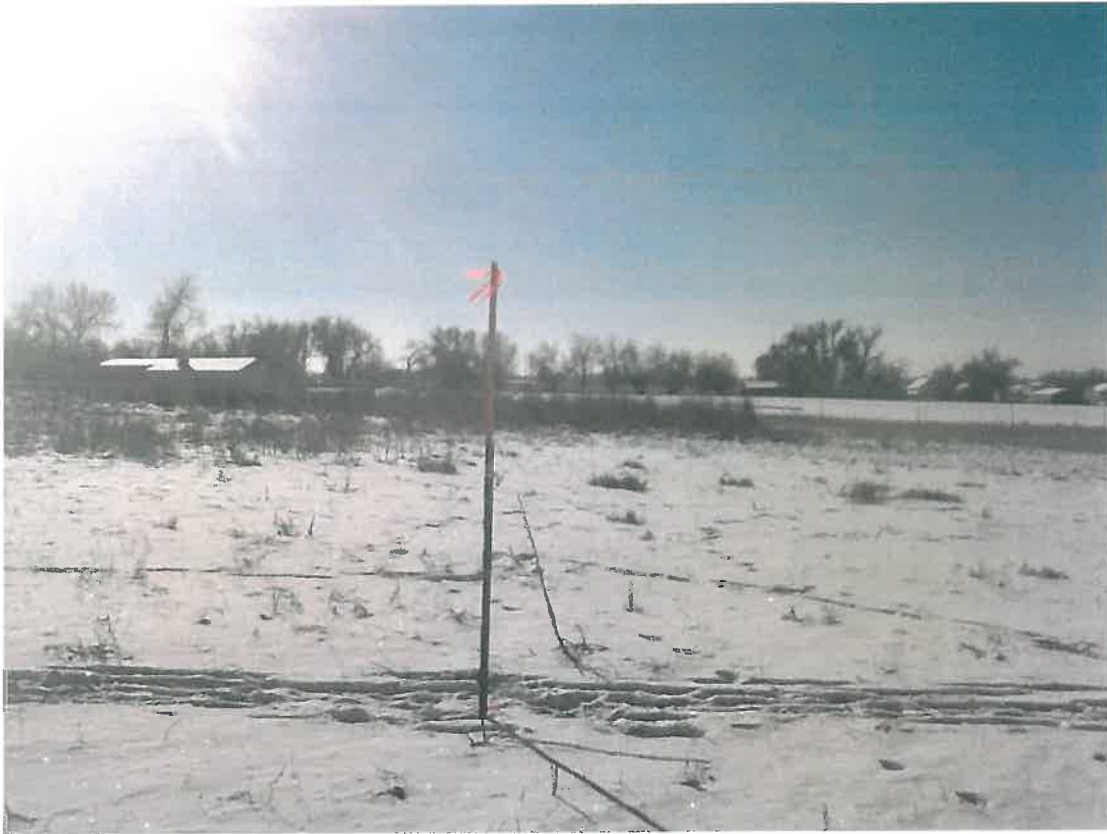
Figure 3: EBERLE PAD LOOKING SOUTH TOWARD TANK BATTERY AREA (NE1/4 SE1/4 SEC 32, T1N, R66W, 12-9-13)