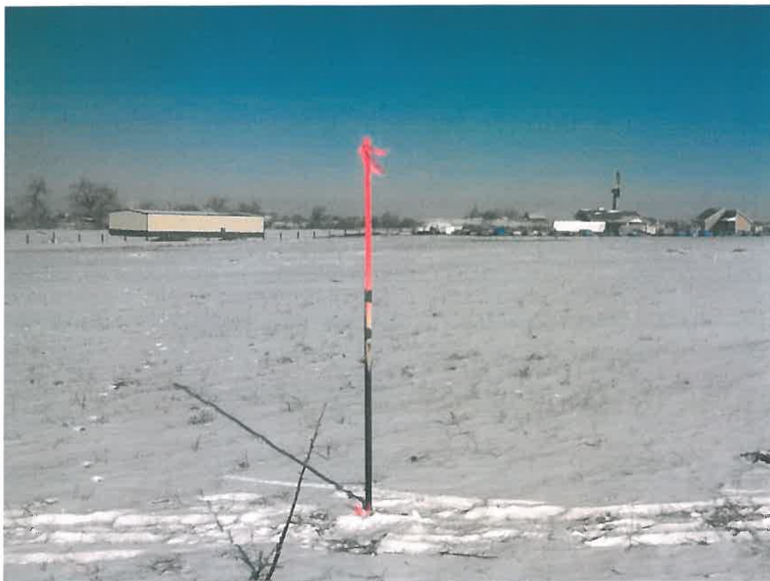
Figure 1: EBERLE PAD LOOKING NORTH (NE1/4 SE1/4 SEC 32, T1N, R66W, 12-9-13)