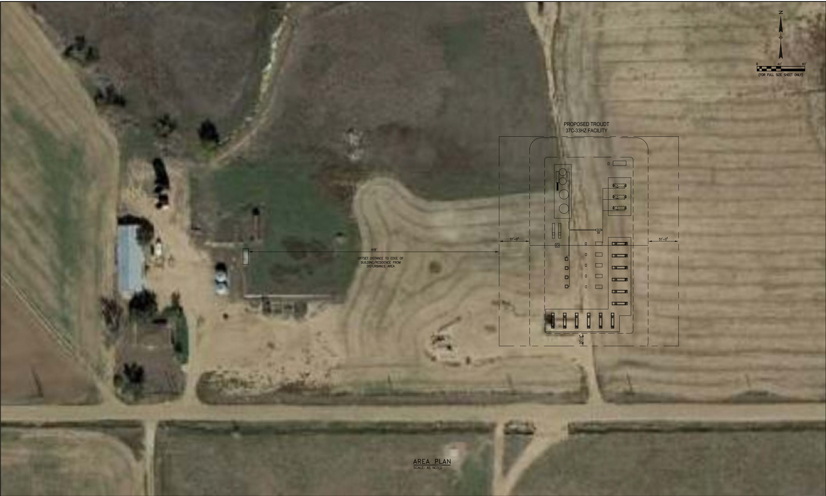
AREA PLAN SCALE: AS NOTED

THIS DRAWING AND THE DESIGN IT COVERS ARE CONFIDENTIAL AND REMAIN THE PROPERTY OF ANADARKO PETROLEUM CORPORATION AND SHALL NOT BE DISCLOSED TO OTHERS OR REPRODUCED IN ANY MANNER OR USED FOR ANY PURPOSE WHATSOEVER EXCEPT BY WRITTEN PERMISSION BY THE OWNER.