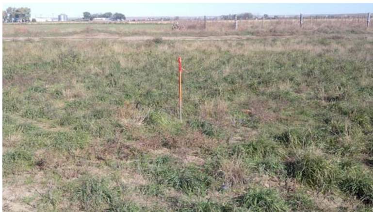
LOOKING NORTH 10/23/13

SECTION 12, TOWNSHIP 4 NORTH, RANGE 60 WEST OF THE 6TH PRINCIPAL MERIDIAN