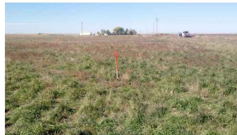
LOOKING WEST 10/23/13