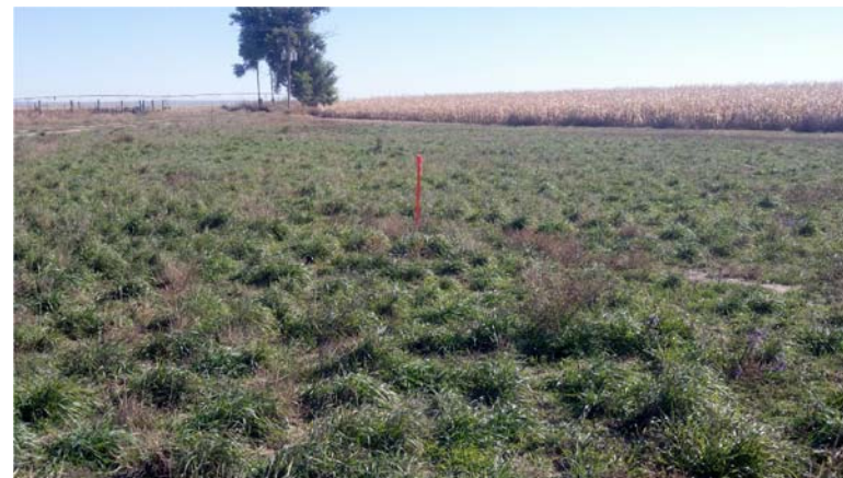
LOOKING EAST 10/23/13