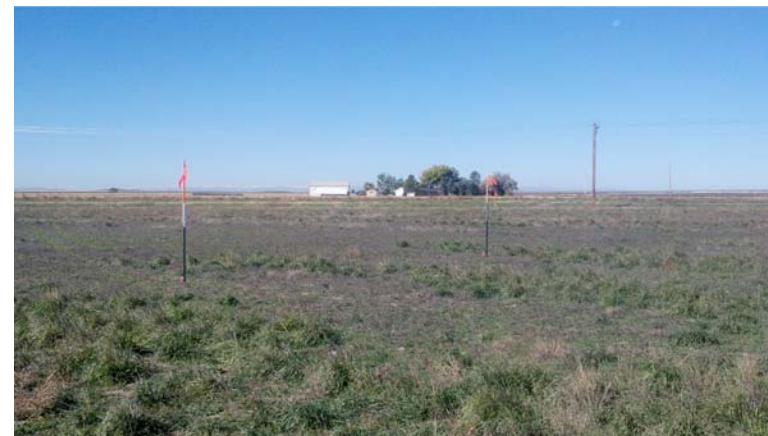
LOOKING WEST 10/23/13