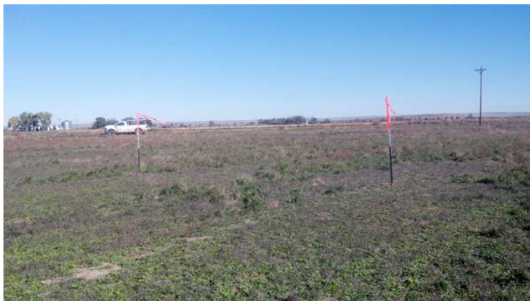
LOOKING NORTH 10/23/13

SECTION 12, TOWNSHIP 4 NORTH, RANGE 60 WEST OF THE 6TH PRINCIPAL MERIDIAN