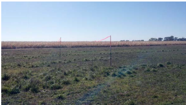
LOOKING SOUTH 10/23/13