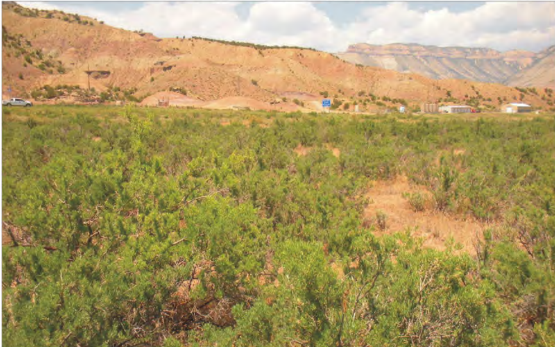
PHOTO: VIEW OF VEGETATION REFERENCE AREA

LOCATED IN GARFIELD COUNTY, COLORADO SECTION 14, T7S, R96W, 6th P.M.