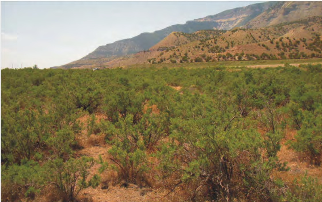
PHOTO: VIEW OF VEGETATION REFERENCE AREA