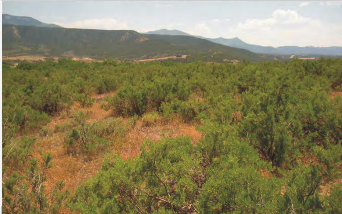
PHOTO: VIEW OF VEGETATION REFERENCE AREA

LOCATED IN GARFIELD COUNTY, COLORADO SECTION 14, T7S, R96W, 6th P.M.