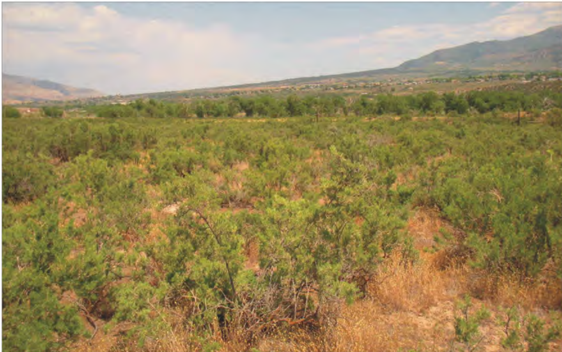
VIEW OF VEGETATION REFERENCE AREA