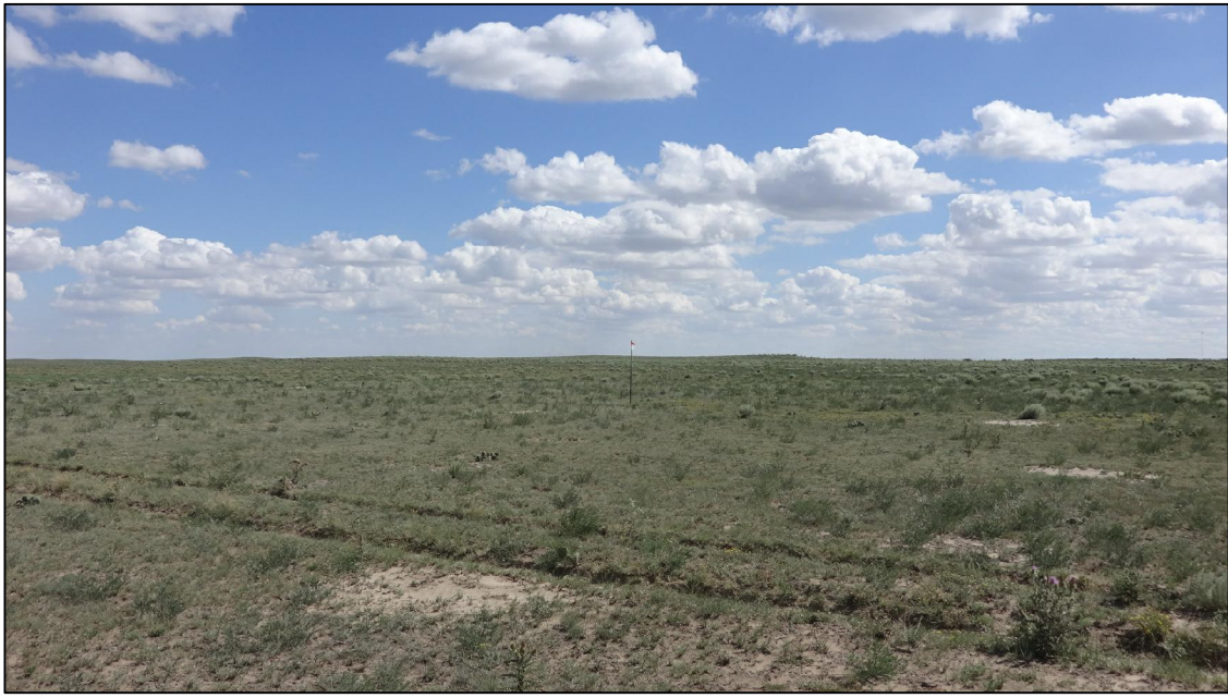
PHOTOGRAPH OF TRESTLE 1648-11-41-H WELL LOCATION - CAMERA ANGLE SOUTH