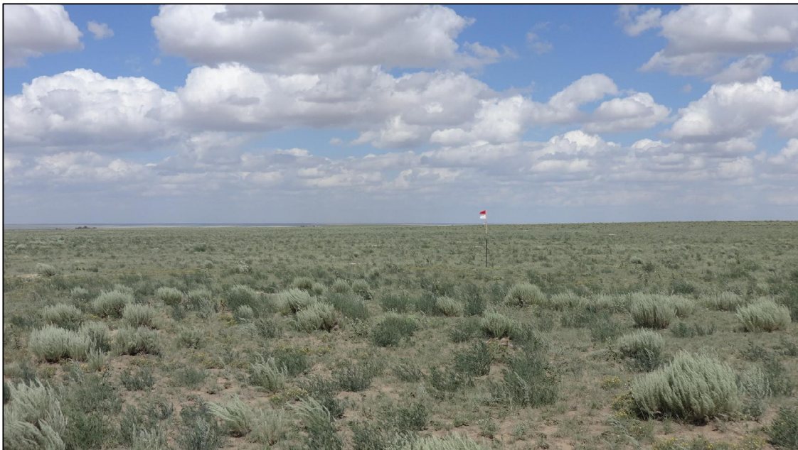
PHOTOGRAPH OF TRESTLE 1648-11-41-H WELL LOCATION - CAMERA ANGLE EAST