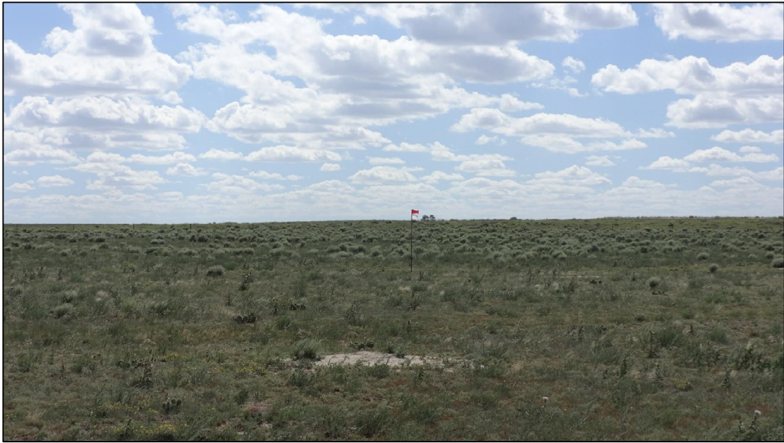
PHOTOGRAPH OF TRESTLE 1648-11-41-H WELL LOCATION - CAMERA ANGLE WEST