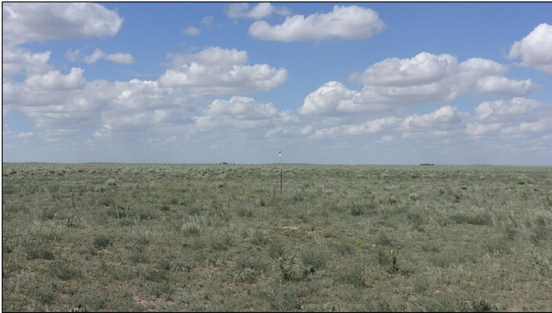
PHOTOGRAPH OF TRESTLE 1648-11-41-H WELL LOCATION - CAMERA ANGLE NORTH