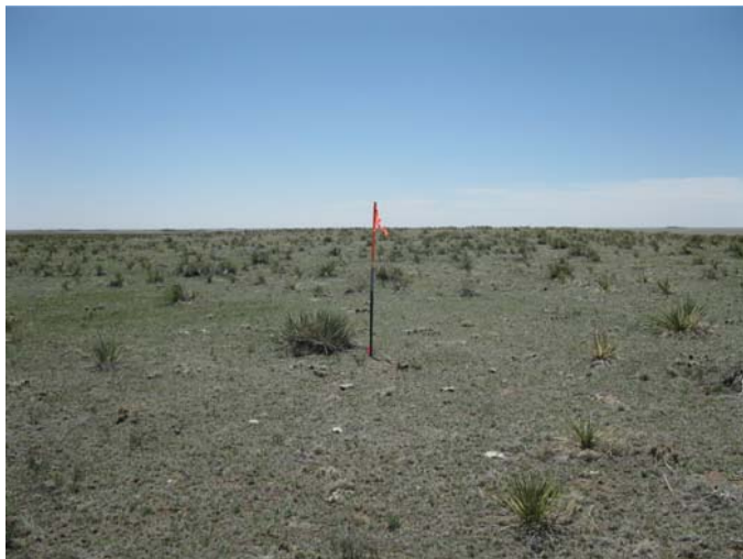
LOOKING SOUTH 5/17/13