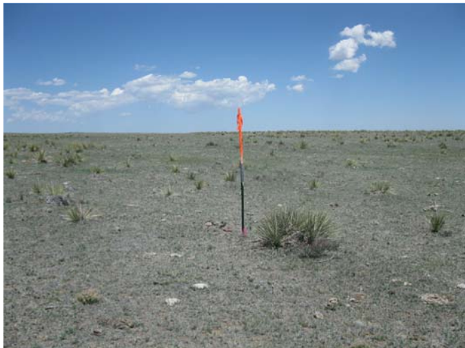
LOOKING NORTH 5/17/13

SECTION 32, TOWNSHIP 12 SOUTH, RANGE 59 WEST OF THE 6TH PRINCIPAL MERIDIAN