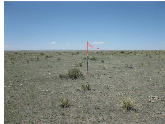
LOOKING WEST 5/17/13