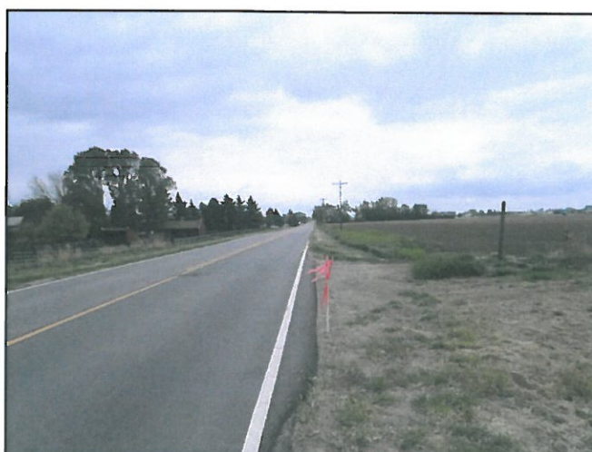
Looking down the roadway to the right of the access