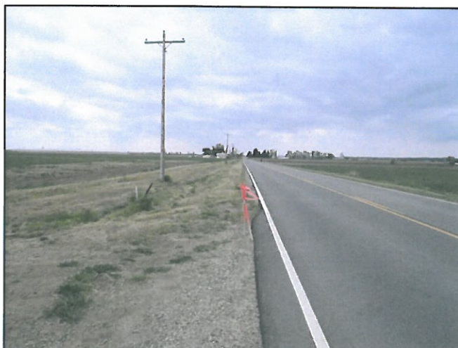
Looking down the roadway to the left of the access