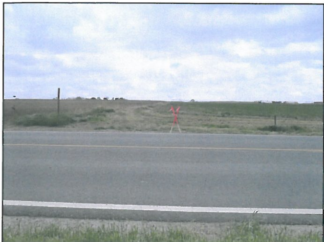
Looking from the roadway into the access location