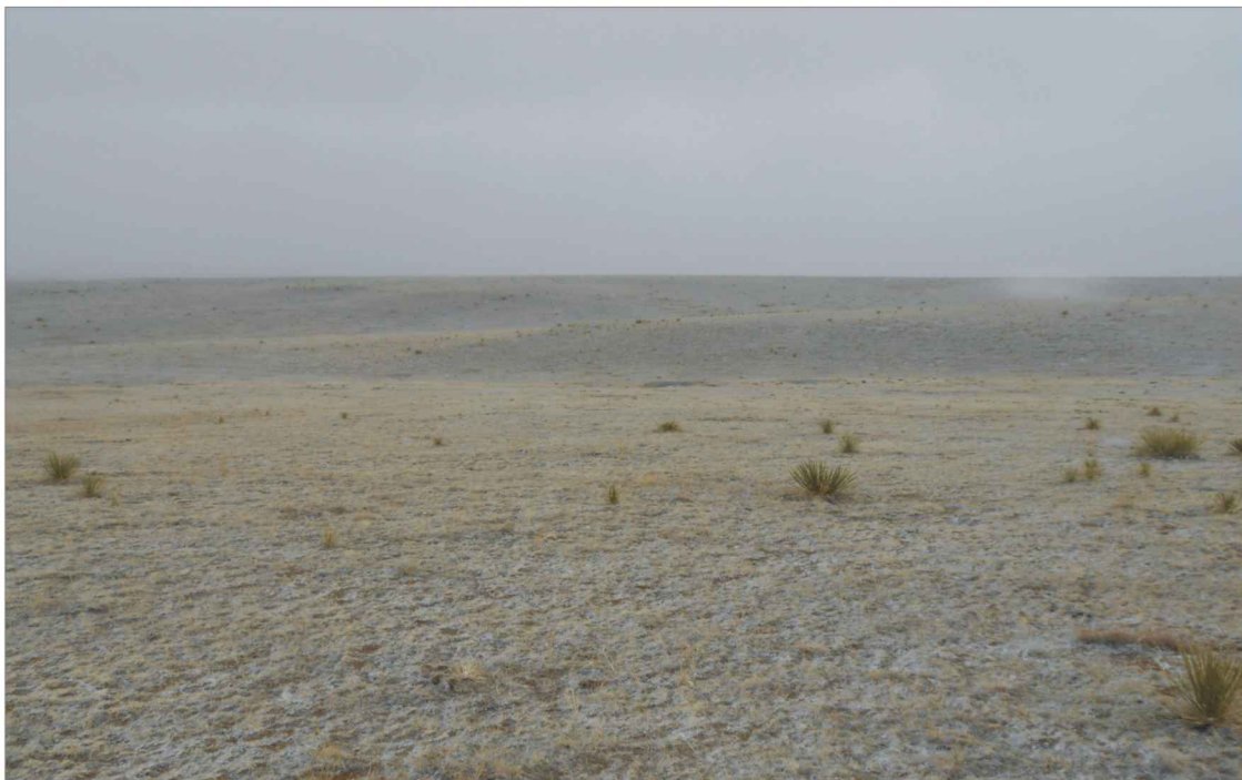
PHOTO: VIEW OF REFERENCE AREA