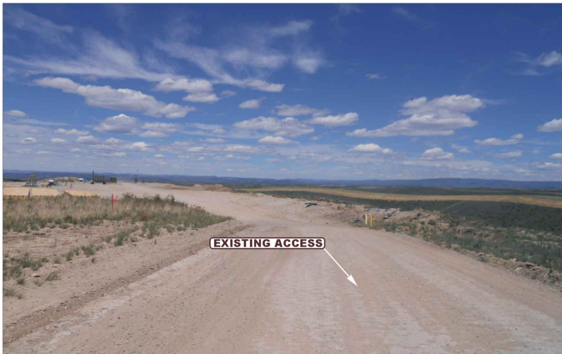
PHOTO: VIEW OF EXISTING ACCESS