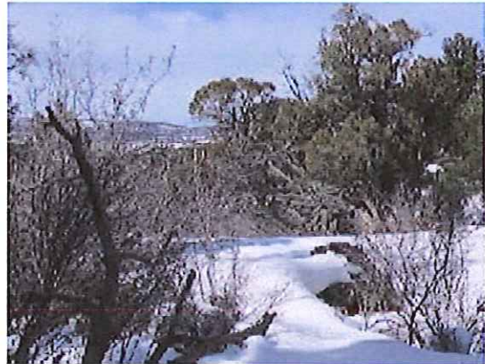
PAD LOCATION LOOKING EAST