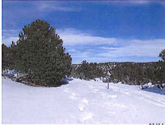
PAD LOCATION LOOKING NORTH

RGU 44-26-198, RGU 543-26-198, RGU 443-26-198, RGU 343-26-198, RGU 43-26-198, RGU 313-25-198, RGU 542-26-198, RGU 13-25-198, RGU 512-25-198, RGU 412-25-198, RGU 442-26-198, RGU 533-26-198, RGU 433-26-198, RGU 333-26-198, RGU 33-26-198, RGU 532-26-198, RGU 432-26-198, RGU 332-26-198, RGU 32-26-198, RGU 531-26-198, RGU 431-26-198