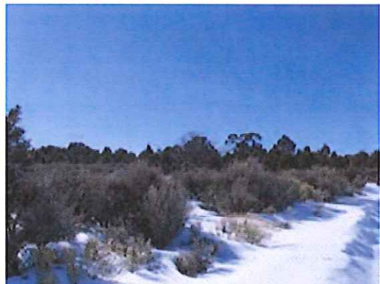
PAD ACCESS LOOKING NORTHERLY

863510 HIGHLANDS CENTRAL REGU 42-26-198 PHOTOGRAPH 2/27/2013 4:01:03 PM