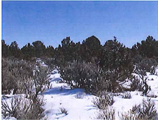
PAD LOCATION LOOKING WEST