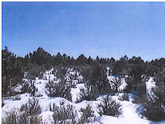
PAD OVERALL LOOKING NORTHERLY