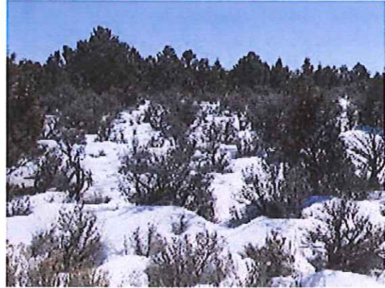
PAD LOCATION LOOKING SOUTH