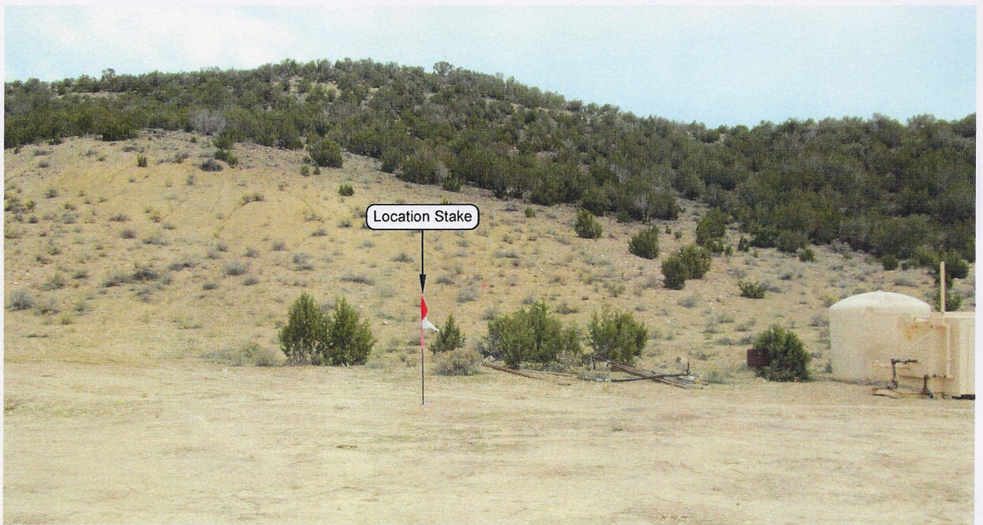
PHOTO LOCATION: LATITUDE LONGITUDE NAD 83: (38° 53' 06.74"N) (108° 01' 35.69"W)