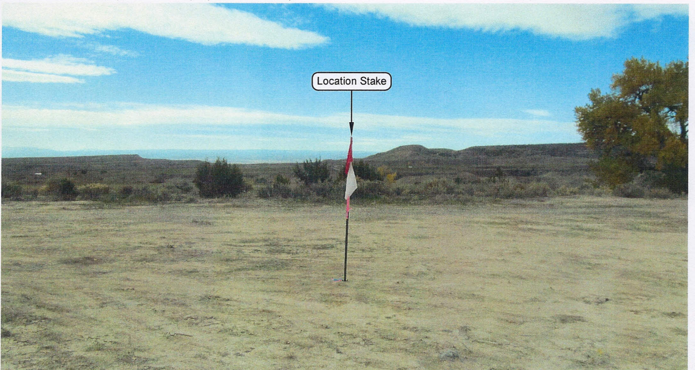
PHOTO LOCATION: LATITUDE LONGITUDE NAD 83: (38° 53' 7.88"N) (108° 01' 35.68"W)