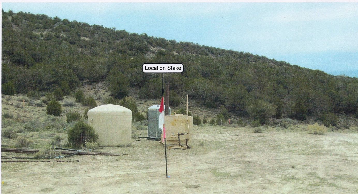
PHOTO LOCATION: LATITUDE LONGITUDE NAD 83: (38° 53' 07.30"N) (108° 01' 34.78"W)