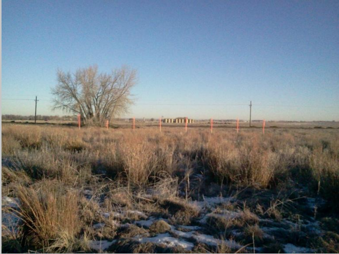
Devore wells • North View

Section 34-T3N-R66W-6 th PM, Weld County, Colorado