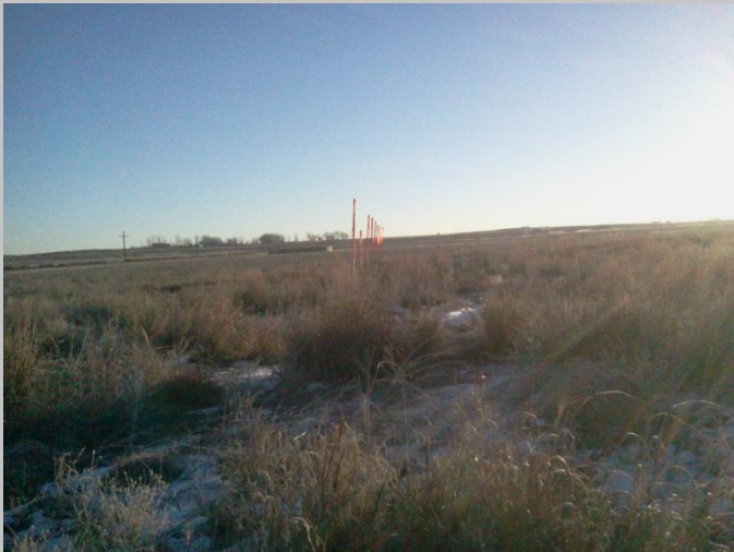
Devore wells • East View