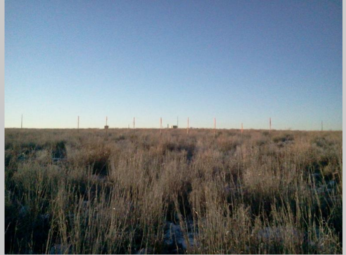
Devore wells • South View