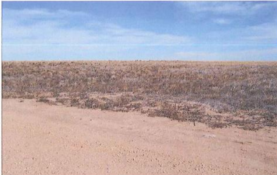
PHOTO: VIEW OF TAKE PAD