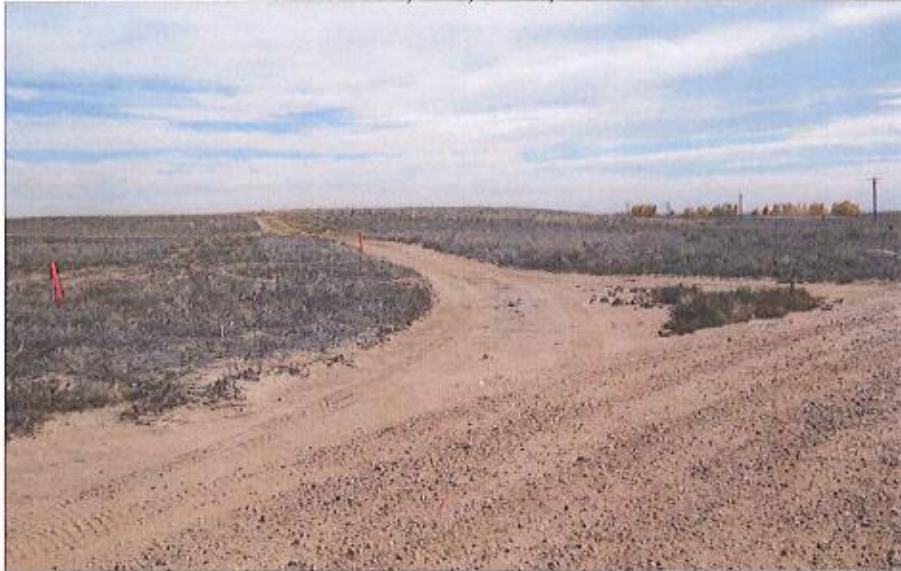
PHOTO: VIEW OF TANK PAD

LOCATED IN WELD COUNTY, COLORADO SECTION 8, T6N, R63W, 6th P.M.