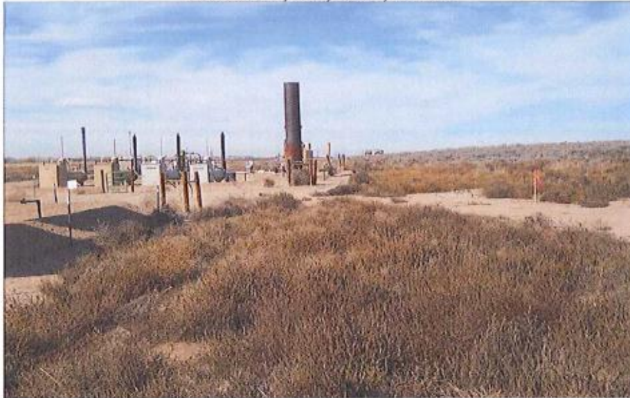
PHOTO: VIEW OF TANK PAD

LOCATED IN WELD COUNTY, COLORADO SECTION 8, T6N, R63W, 6th P.M.