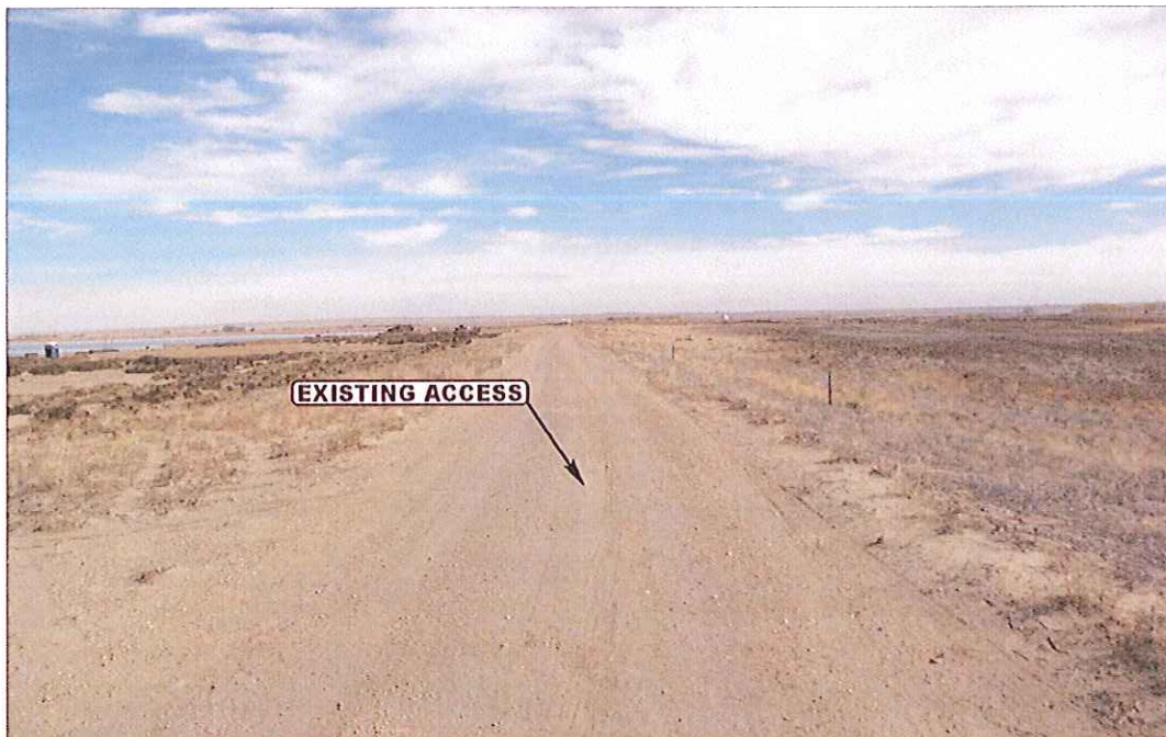
PHOTO: VIEW FOF EXISTING ACCESS