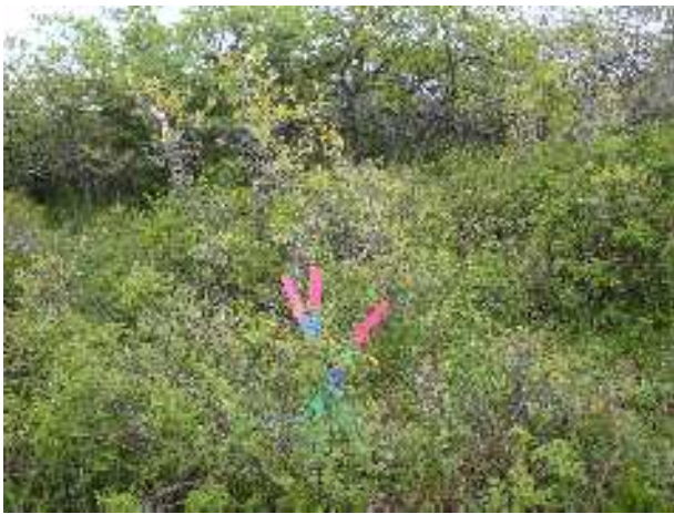
LOOKING EAST TOWARD CENTER OF RESERVE AREA JUNE 4, 2009