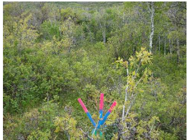
LOOKING WEST TOWARD CENTER OF RESERVE AREA JUNE 4, 2009