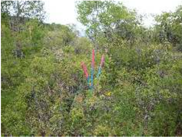
LOOKING NORTH TOWARD CENTER OF RESERVE AREA JUNE 4, 2009