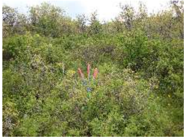
LOOKING SOUTH TOWARD CENTER OF RESERVE AREA JUNE 4, 2009