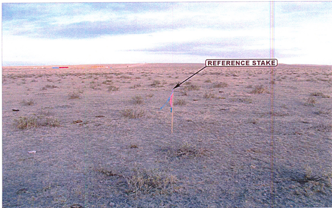
PHOTO: VIEW OF REFERENCE STAKE