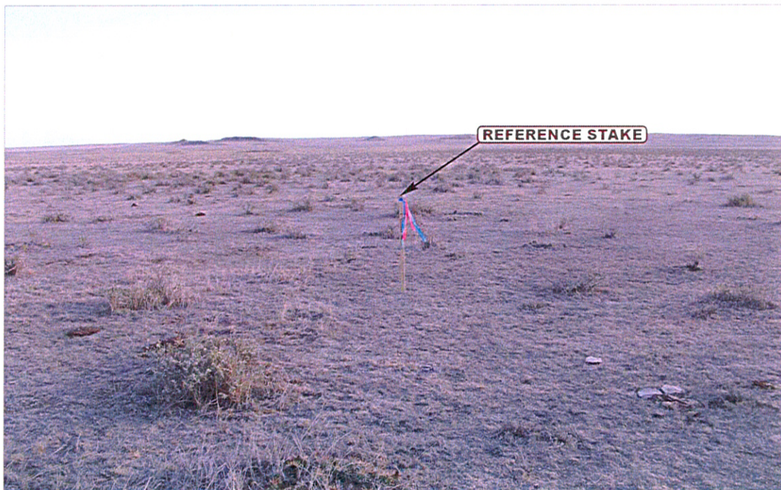
PHOTO: VIEW OF REFERENCE STAKE