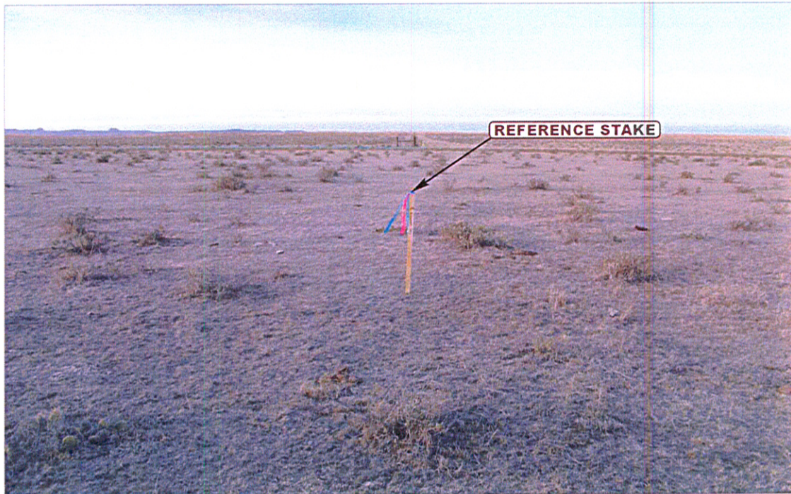
PHOTO: VIEW OF REFERENCE STAKE