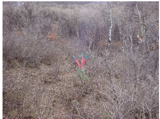
LOOKING WEST TOWARD CENTER OF RESERVE AREA JUNE 4, 2009