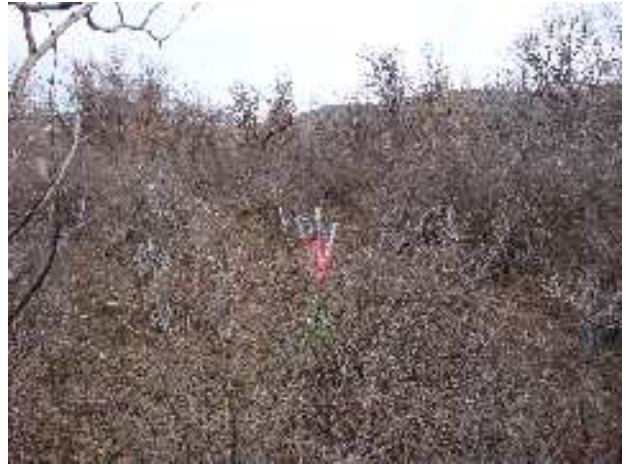
LOOKING SOUTH TOWARD CENTER OF RESERVE AREA JUNE 4, 2009