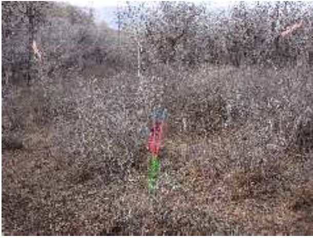
LOOKING NORTH TOWARD CENTER OF RESERVE AREA JUNE 4, 2009