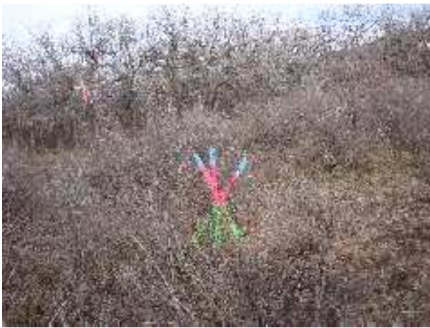
LOOKING EAST TOWARD CENTER OF RESERVE AREA JUNE 4, 2009