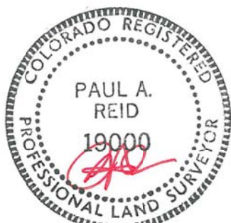
EXHIBIT I-B: VISIBLE IMPROVEMENTS PLAT HOMER DEEP UNIT 9-11AH LOCATED IN: NW¼ NW¼ OF SECTION 9 T. 8 S., R. 98 W., 6TH P.M. GARFIELD COUNTY, COLORADO