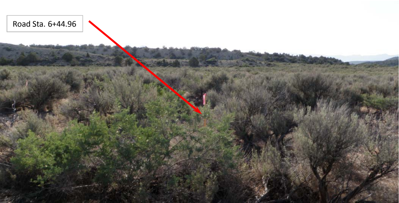
Photo No. : 9-11A-1 - Photo Date: 5/12/12 Photo Desc: Looking Up Station on Proposed Road Camera Station: 39°22'43.75404" N, 108°20'15.26765" W Station Desc: Station 0+00 of Proposed Road