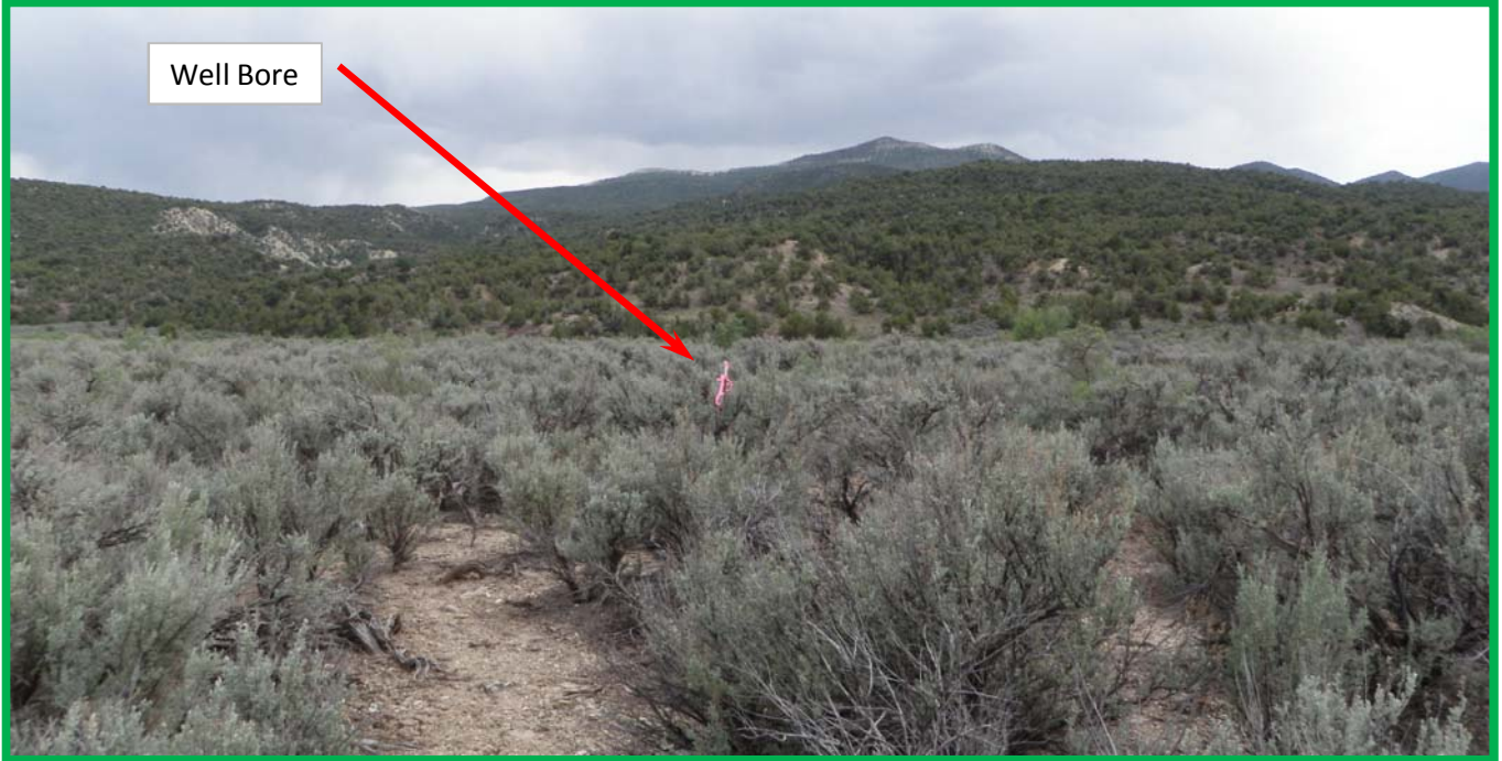
Photo No. : 9-11A-D - Photo Date: 5/12/12 Photo Desc: Looking South toward HDU 9-11AH Well Bore Camera Station: 39°22'49.38535" N, 108°20'22.96170" W Station Desc: 50' North of HDU 9-11AH Well Bore

Exhibit VA-2 (2 of 2): Well Site Photos Homer Deep Unit 9-11AH NW ¼ NW ¼, Section 9, T. 8 S., R. 98 W. Garfield County, Colorado