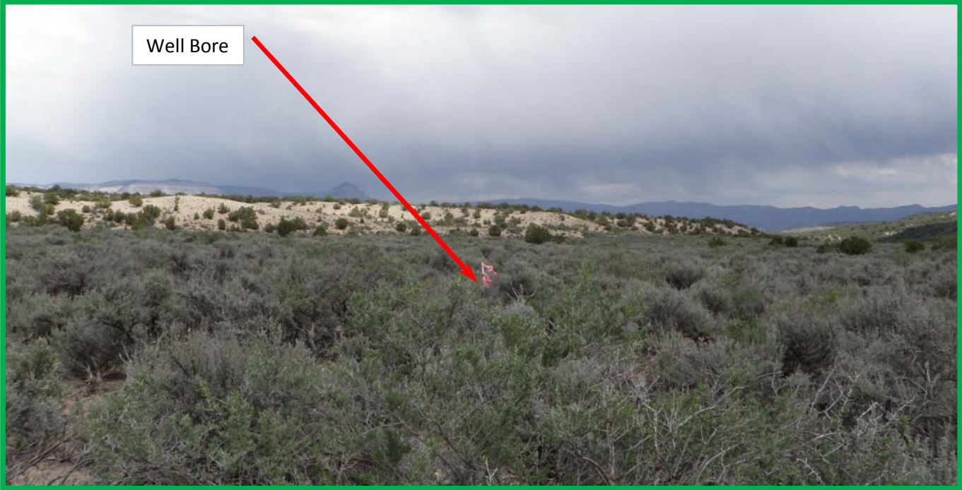
Photo No. : 9-11A-A - Photo Date: 5/12/12 Photo Desc: Looking East toward HDU 9-11AH Well Bore Camera Station: 39°22'48.89073" N, 108°20'23.59877" W Station Desc: 50' West of HDU 9-11AH Well Bore