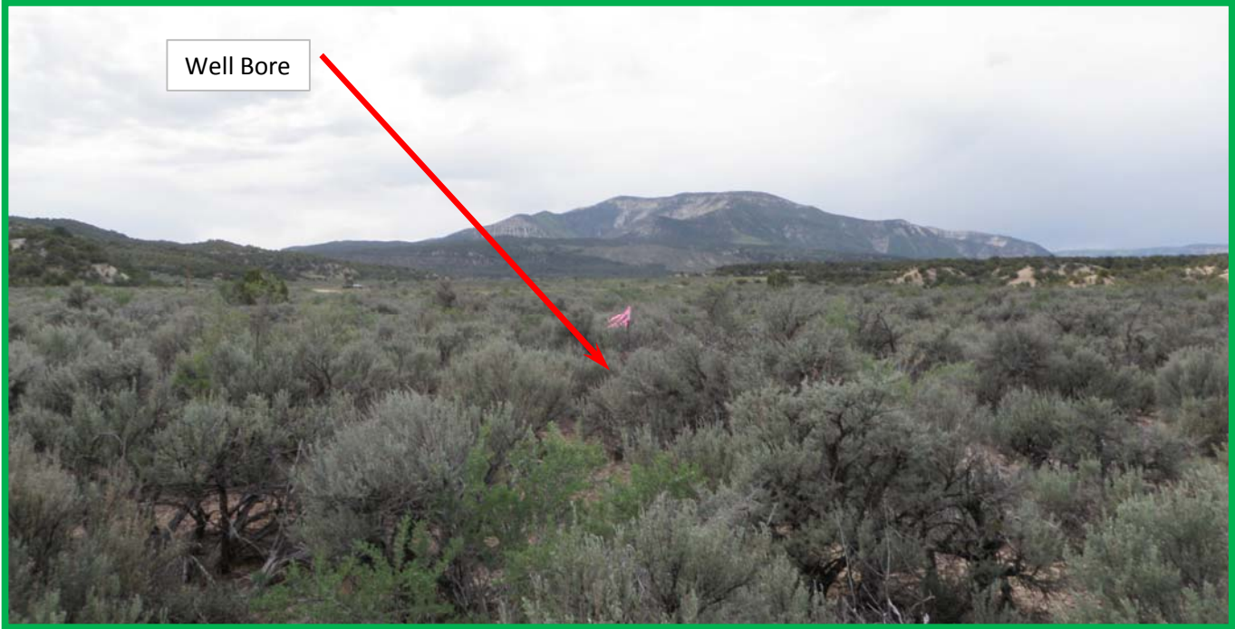
Photo No. : 9-11A-C - Photo Date: 5/12/12 Photo Desc: Looking West toward HDU 9-11AH Well Bore Camera Station: 39°22'48.89127" N, 108°20'22.32475" W Station Desc: 50' East of HDU 9-11AH Well Bore