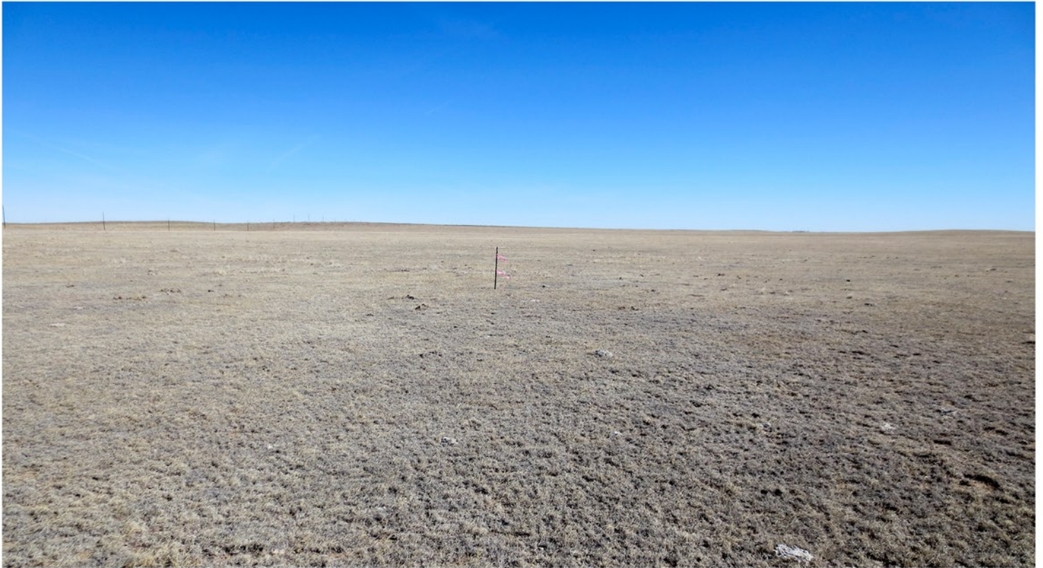
WELL PAD VIEW (LOOKING EAST)