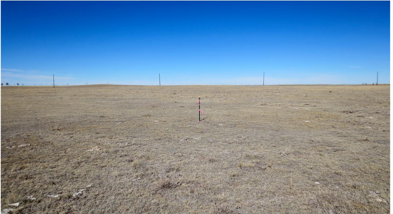
WELL PAD VIEW (LOOKING NORTH)