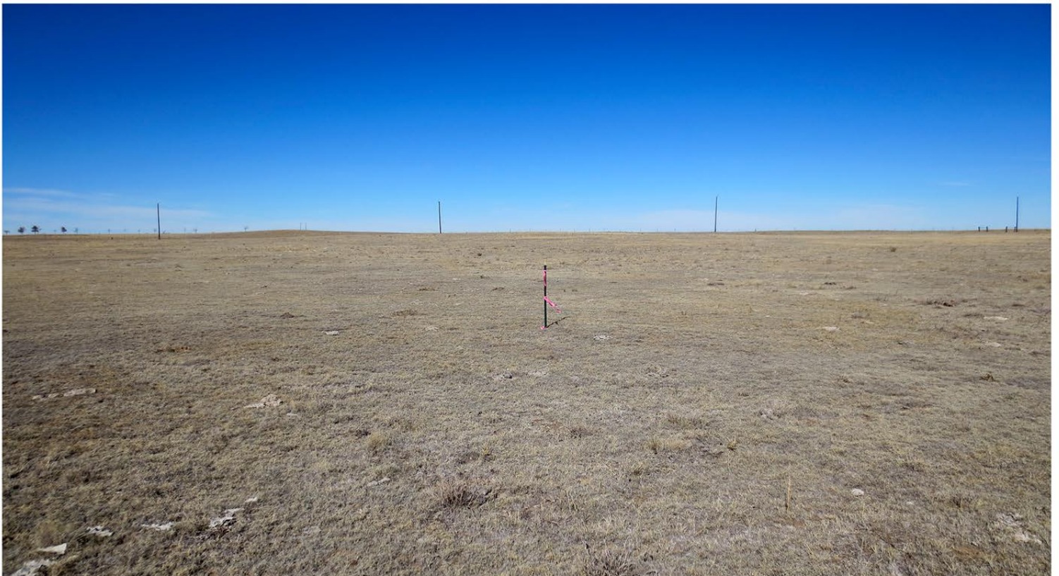
WELL PAD VIEW (LOOKING SOUTH)