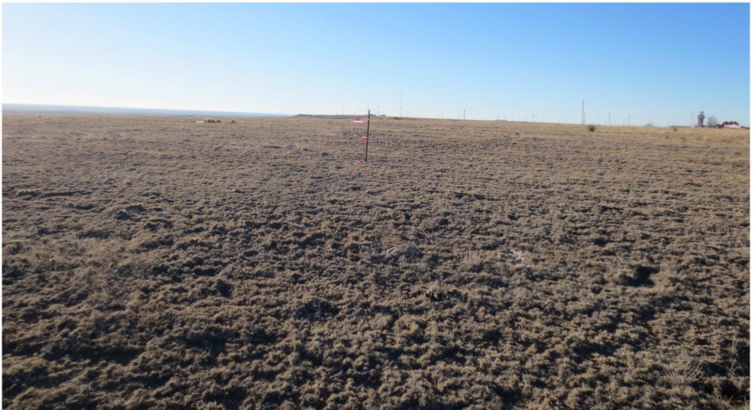
WELL PAD VIEW (LOOKING WEST)