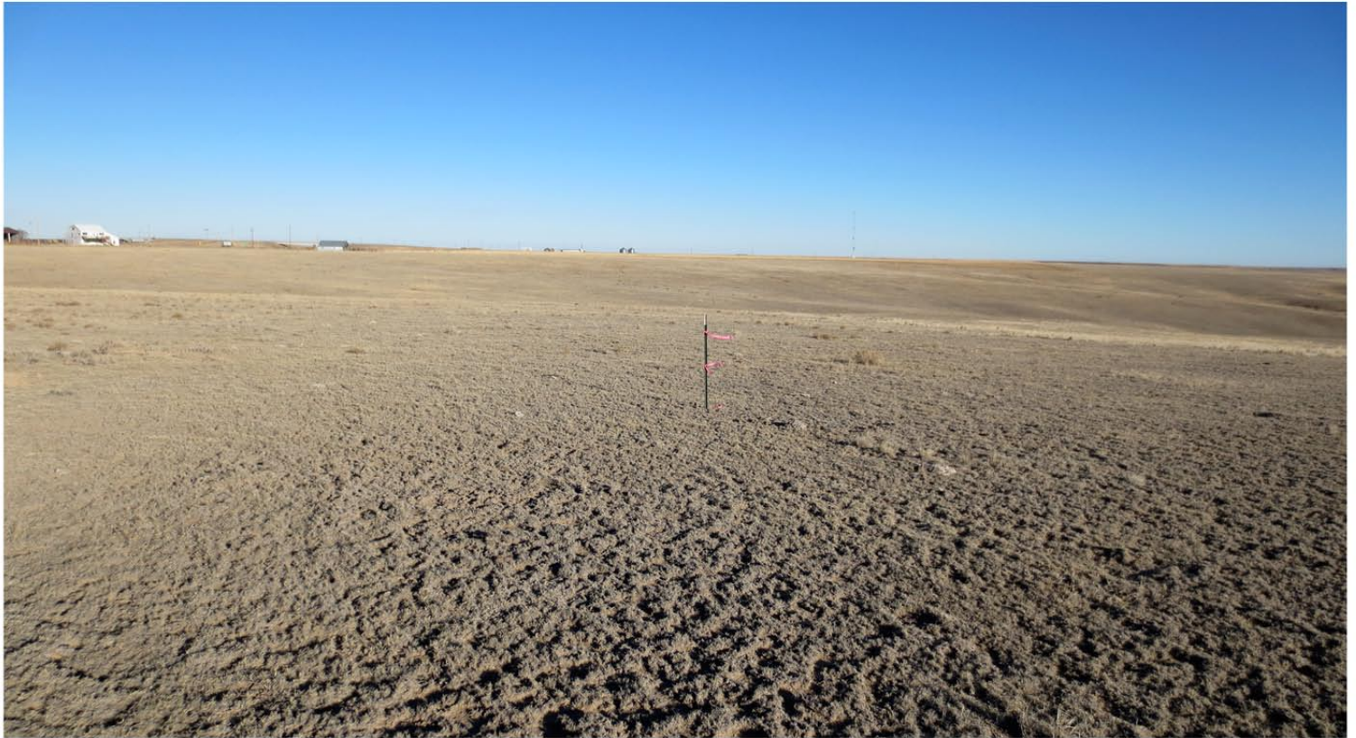
WELL PAD VIEW (LOOKING EAST)