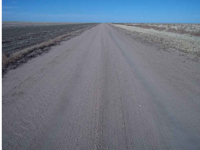
VIEW NORTH (CR J)