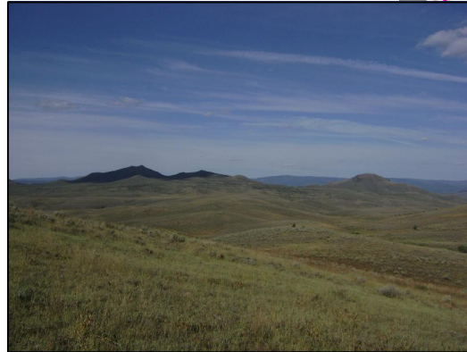
LOCATION LOOKING EAST (#2)