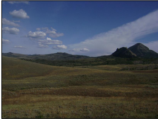
LOCATION LOOKING SOUTH (#3)