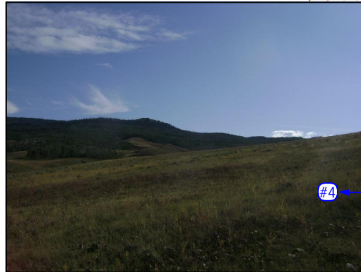
LOCATION LOOKING WEST (#4)