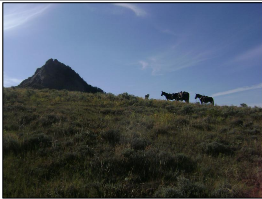
LOCATION LOOKING NORTH (#1)