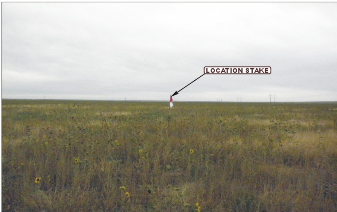
PHOTO: VIEW OF LOCATION STAKE