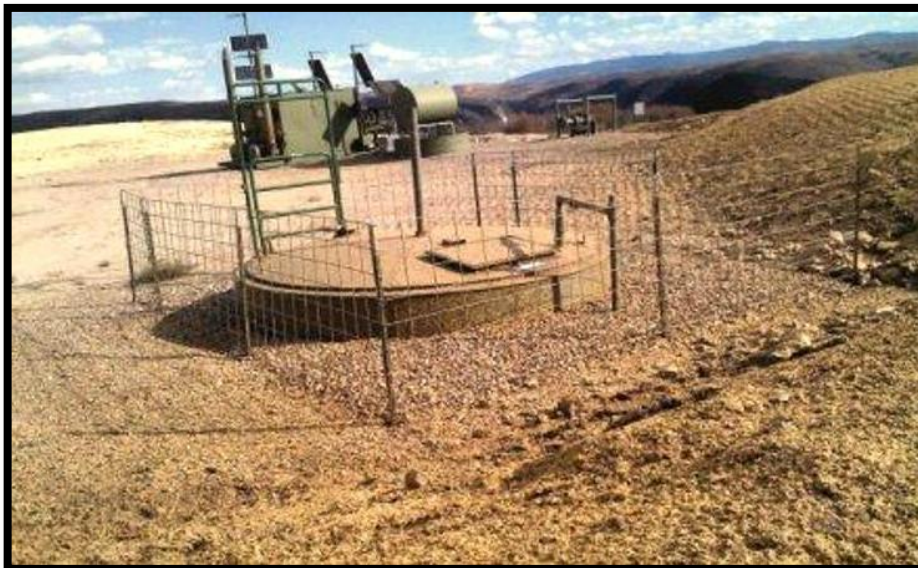
View of re-contoured slopes,, w/contoured disking, & mulching. PBV is clean & well fenced but requires secondary containment .