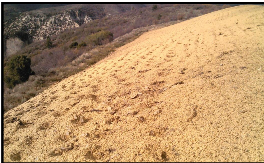
Reworked surface areas enclosing pad. Surfaces are tilled, mulched, & have pocket-hole design features. Vegetated 2ndary ditches & berms along toe of pad area.