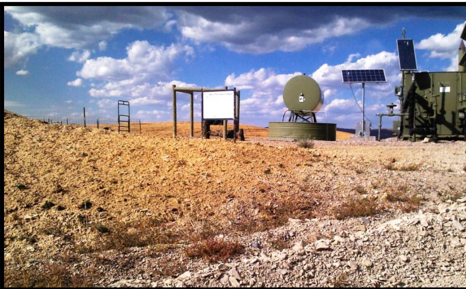
View of Location near entrance, signage, mulched & surface prepared perimeter exteriors & secondary containment for methanol tank.