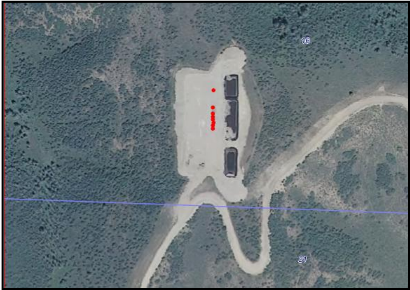
COGCC Map guide 2009 Aerial Photo: Drilling reserve pit, (which is now backfilled & graded)