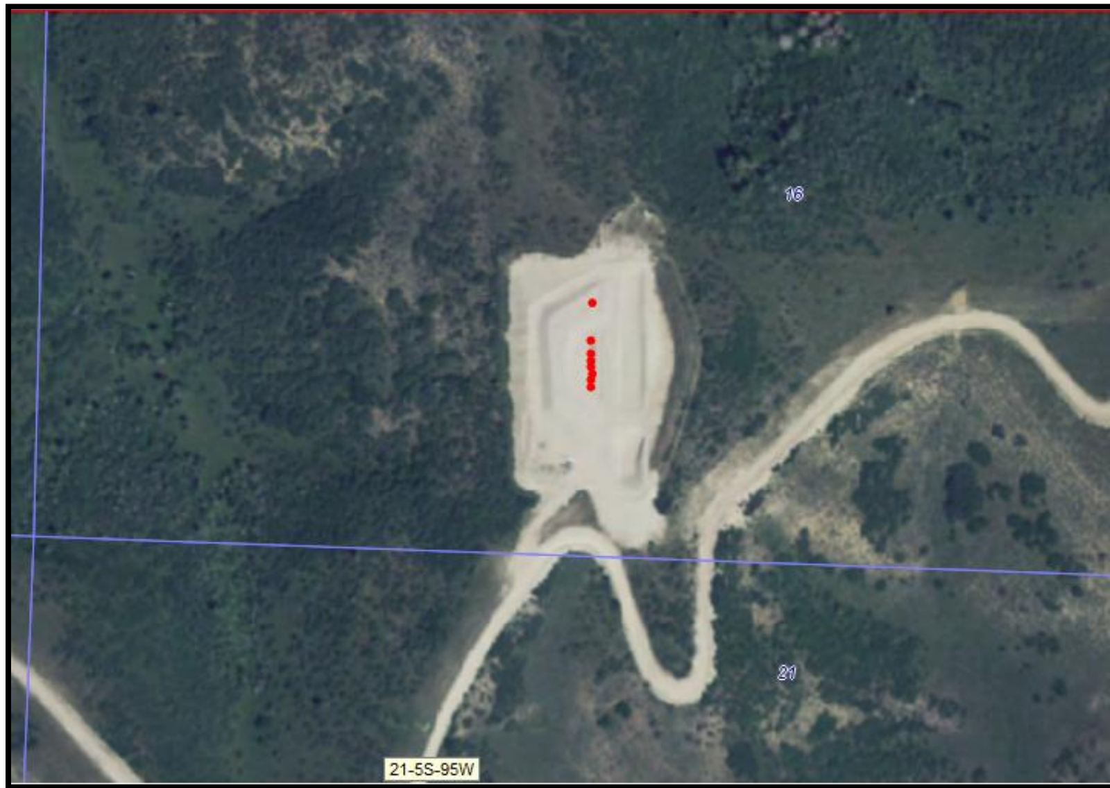
COGCC Map guide 8/2011 Aerial Photo: re-bermed areas