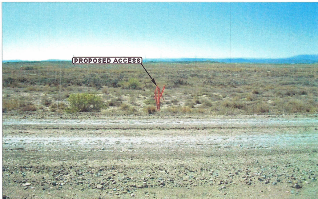
PHOTO: VIEW OF PROPOSED ACCESS