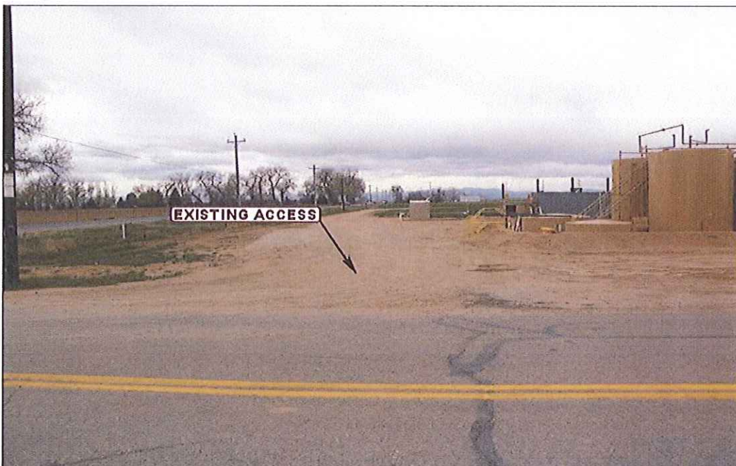
PHOTO: VIEW FROM BEGINNING OF EXISTING ACCESS