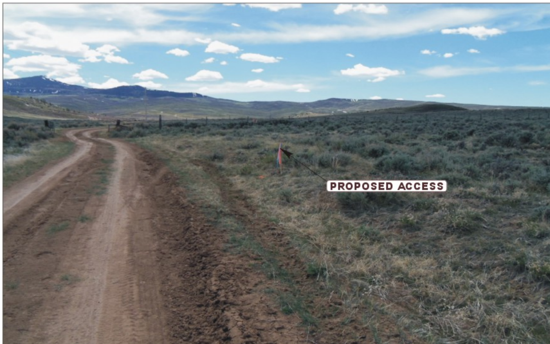
PHOTO: VIEW OF PROPOSED ACCESS