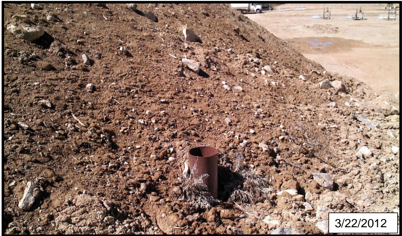
Open borehole – unknown. Possibly greater than 100' deep.