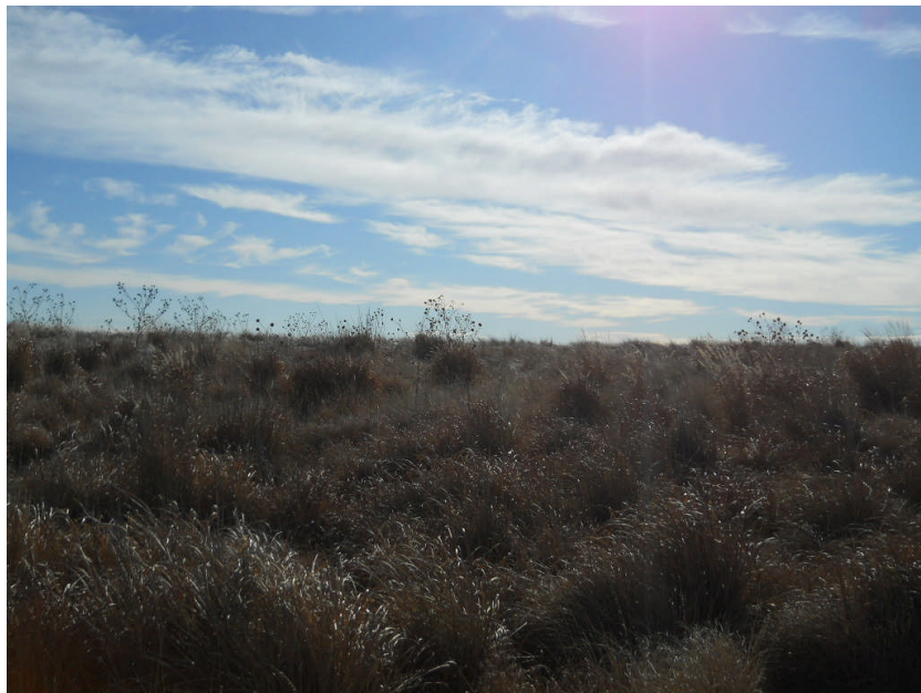
Deterding BB-15 1S45W NW ¼ NW ¼ SEC. 15, T1S, R45W Looking South from Lat:39.97234 Long:-102.40748 20 December, 2011