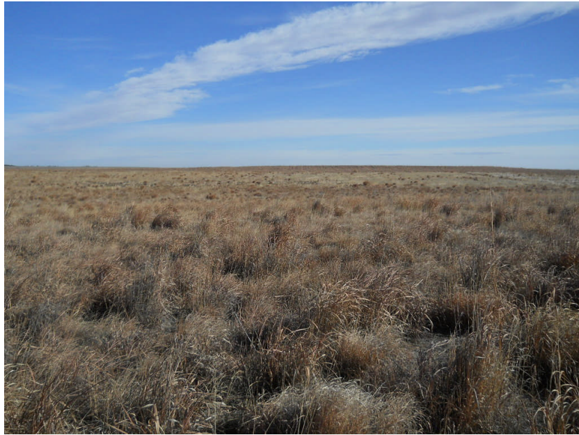
Deterding BB-15 1S45W NW ¼ NW ¼ SEC. 15, T1S, R45W Looking East from Lat:39.97273 Long:-102.40693 20 December, 2011