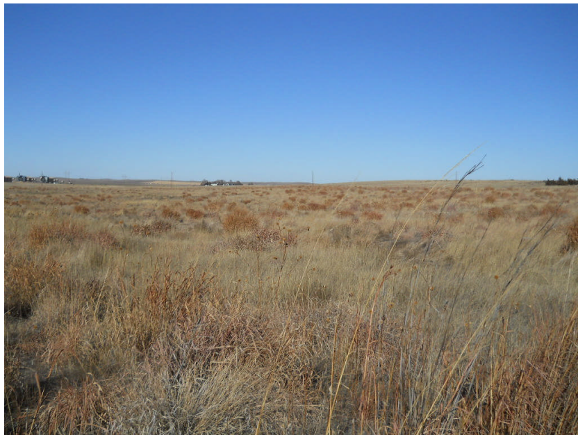
Deterding BB-15 1S45W NW ¼ NW ¼ SEC. 15, T1S, R45W Looking North from Lat:39.97316 Long:-102.40744 20 December, 2011