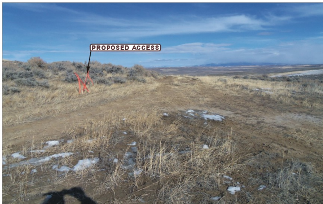
PHOTO: VIEW FROM BEGINNING OF THE PROPOSED ACCESS