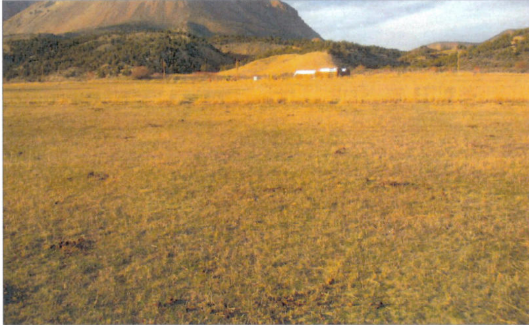
PHOTO: VIEW OF PROPOSED PAD