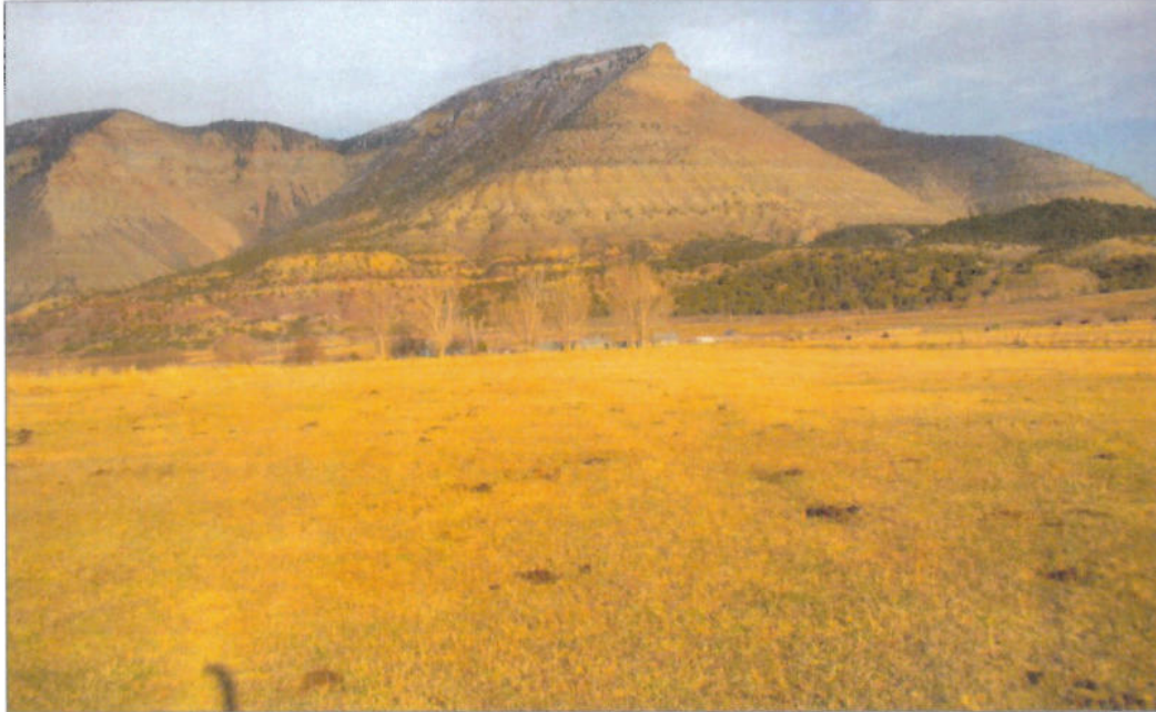
PHOTO: VIEW OF PROPOSED PAD