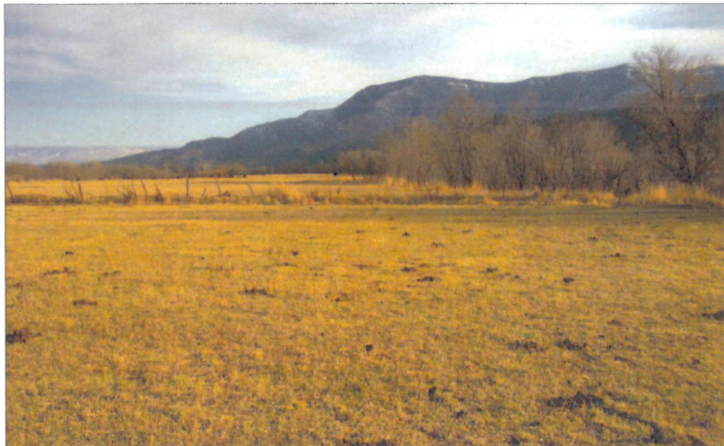
PHOTO: VIEW OF PROPOSED PAD