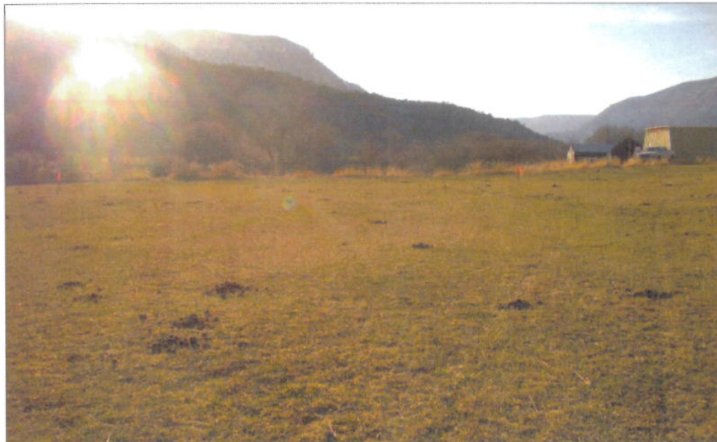
PHOTO: VIEW OF PROPOSED PAD