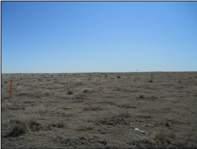
BLACK HOLLOW 8-67-16-3H South.jpg