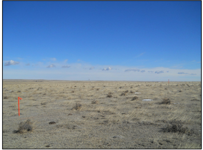
BLACK HOLLOW 8-67-16-3H East.jpg