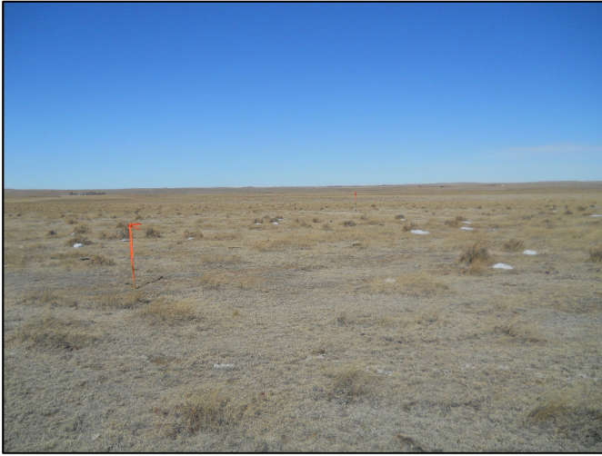
BLACK HOLLOW 8-67-16-3H North.jpg