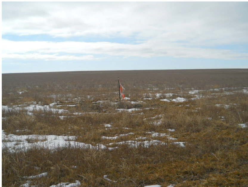
Flatland 844-10-31 NW ¼ NE ¼ SEC. 10, T8N, R44W Looking South 15 February, 2012