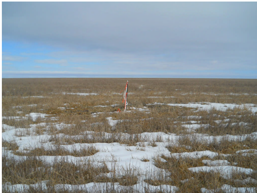
Flatland 844-10-31 NW ¼ NE ¼ SEC. 10, T8N, R44W Looking North 15 February, 2012