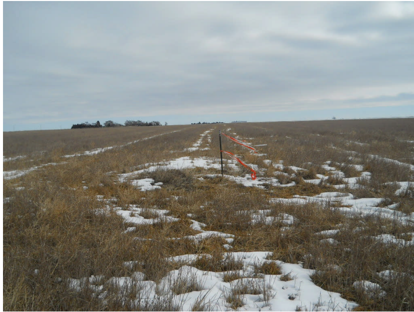
Flatland 844-10-31 NW ¼ NE ¼ SEC. 10, T8N, R44W Looking East 15 February, 2012