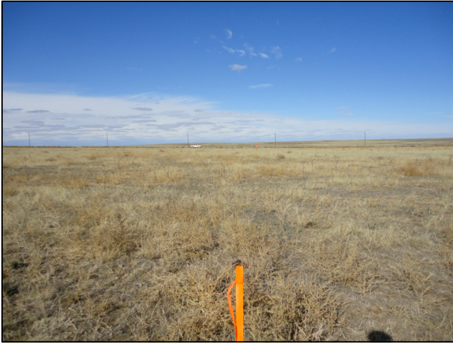
CROW VALLEY 7-62-23-2H North.jpg