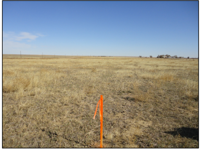
CROW VALLEY 7-62-23-2H East.jpg