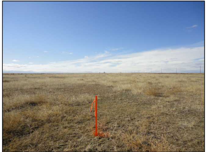
CROW VALLEY 7-62-23-2H West.jpg