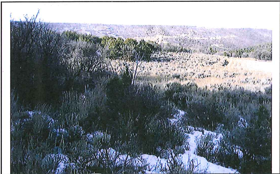
PHOTO: VIEW FROM PAD CENTER