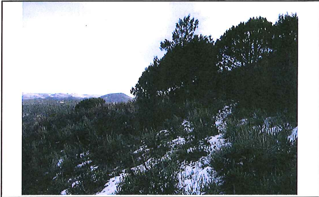
PHOTO: VIEW FROM PAD CENTER

KP 432-26, KP 32-26, KP 542-26, KP 342-26, KP 541-26, KP 22-26, KP 421-26, KP 431-26, KP 31-26, KP 341-26