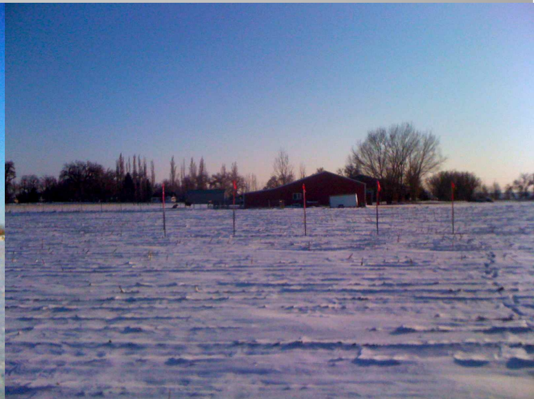
Minch wells • South View