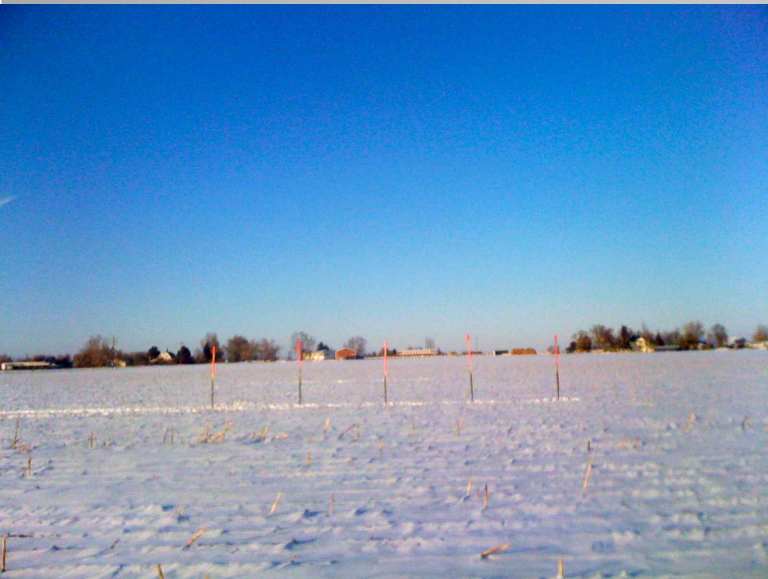
Minch wells • North View