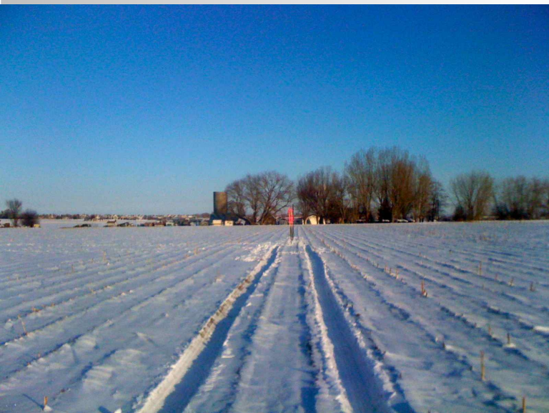
Minch wells • East View