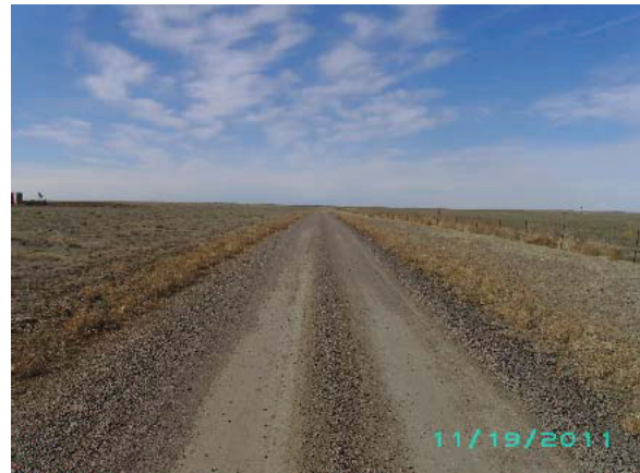
EXISTING ROAD AT TAKE-OFF LOOKING WEST