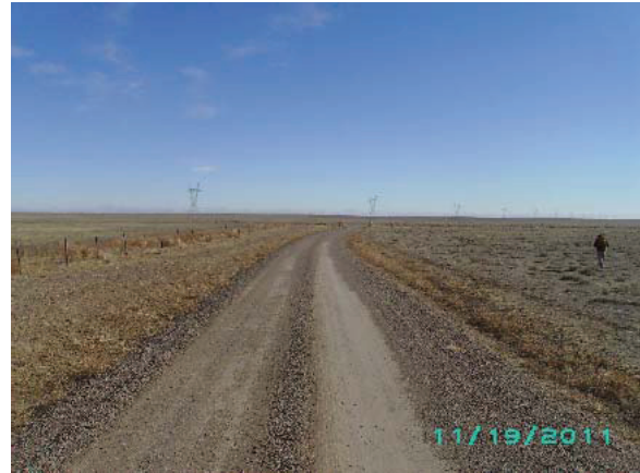
EXISTING ROAD AT TAKE-OFF LOOKING EAST