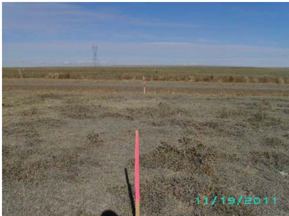
PROPOSED ACCESS AT PAD LOOKING NORTH