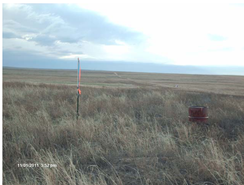
PRONGHORN 41-44-18 HZ NE 1/4 NE 1/4 SEC. 18 T5N R61W LOOKING WEST NOVEMBER 1, 2011