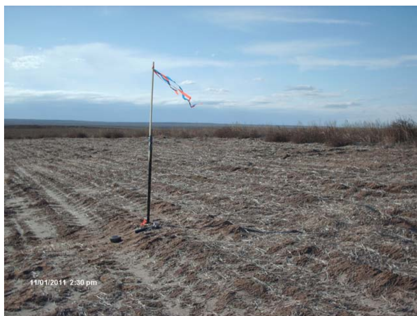
PRONGHORN 31-34-17 HZ NW 1/4 NE 1/4 SEC. 17 T5N R61W LOOKING WEST NOVEMBER 1, 2011